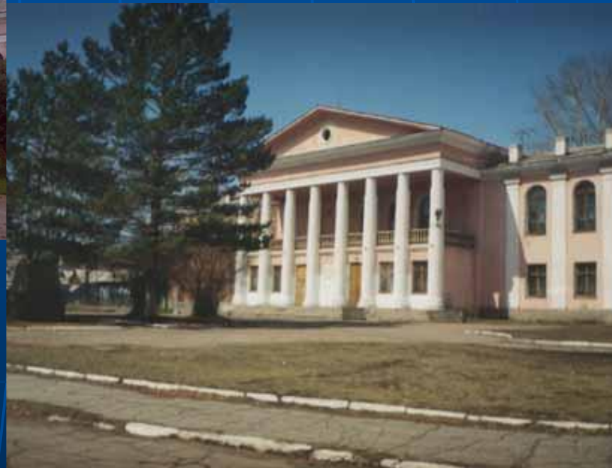
House of Culture «Gornyak».