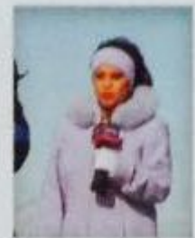
a reporter [rɪˈpɔ:tə]