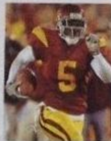
a sportsman [ˈspɔːtsmən]