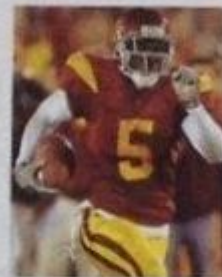
a sportsman [ˈspɔ:tsmən]