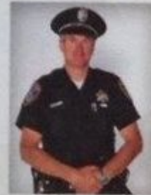
a police officer [pəˈli:s ˌɒfɪsə]