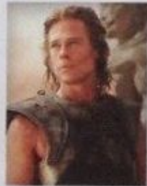
an actor/ actress [ˈæktə] [ˈæktɪs]