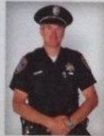
a police officer [pəˈliːs ˌɒfɪsə]