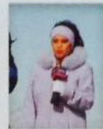
a reporter [rɪˈpɔ:tə]