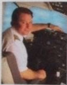
a pilot [ˈpaɪlət]