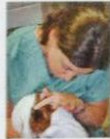
a vet (veterinarian) [ˌvetərɪˈneəriən]