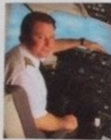
a pilot [ˈpaɪlət]