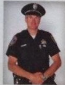
a police officer [pəˈli:s ˌɒfɪsə]