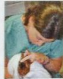
a vet (veterinarian) [ˌvetərɪˈneəriən]