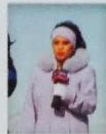
a reporter [rɪˈpɔːtə]