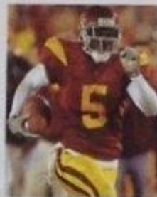
a sportsman [ˈspɔ:tsmən]