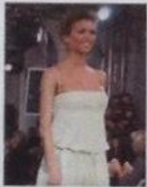
a model [ˈmɒdl]