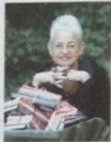
a writer [ˈraɪtə]