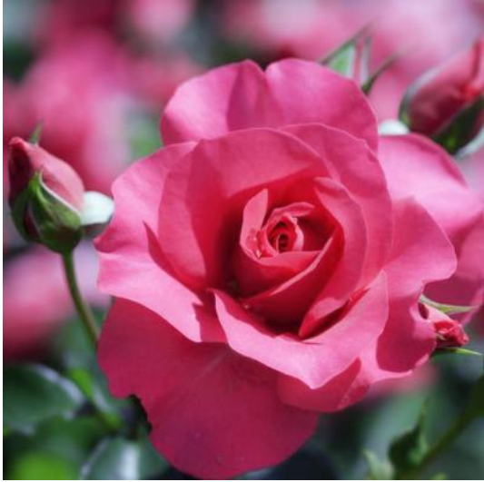
rose / роза