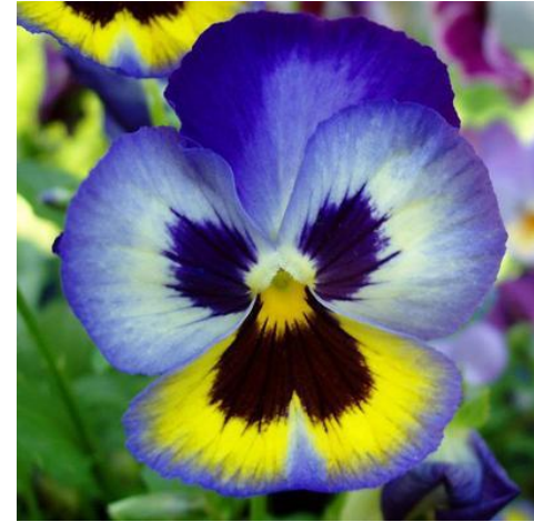
pansy / анютины глазки