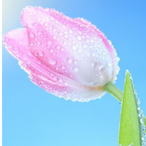
tulip / тюльпан