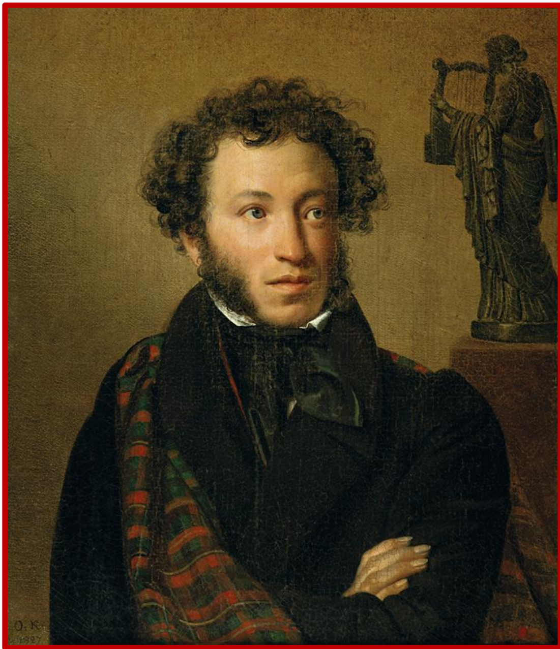
The Portrait of A. Pushkin, Orest Riprensky y