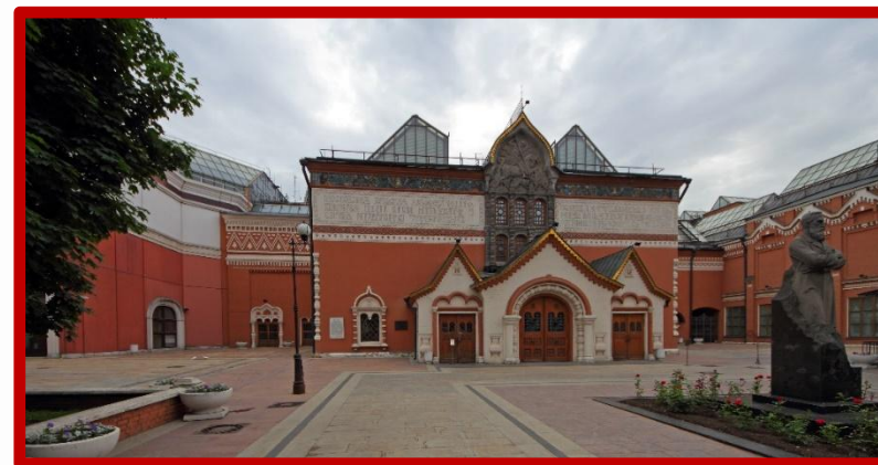
The Tretjakov Art Gallery in Moscow