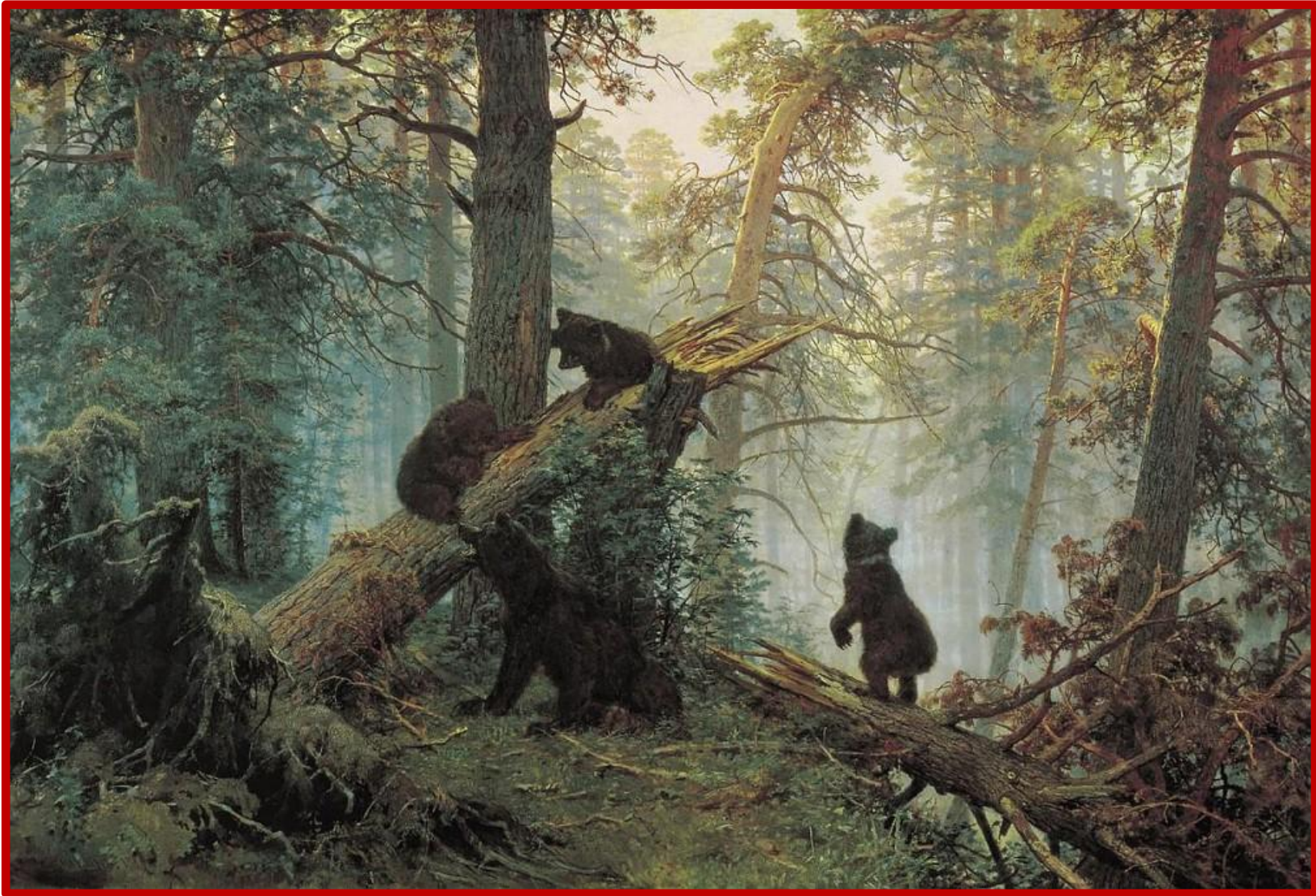
Morning in a Pine Forest, Ivan Shishkin