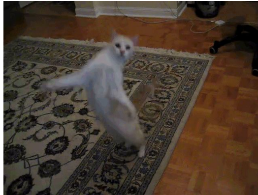
Cats can dance.