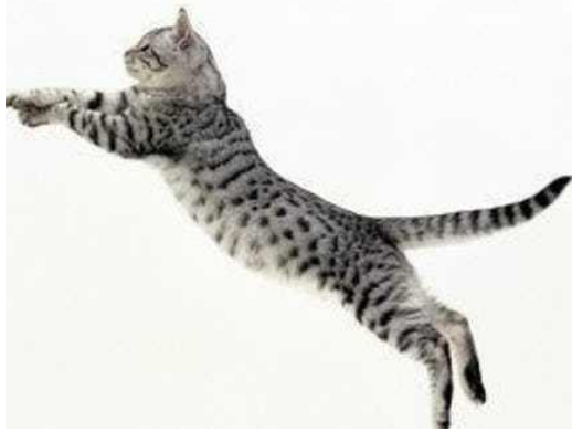
Cats can jump.