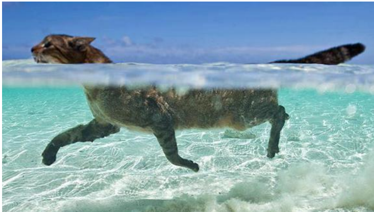
Cats can swim.