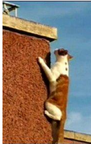
Cats can climb.