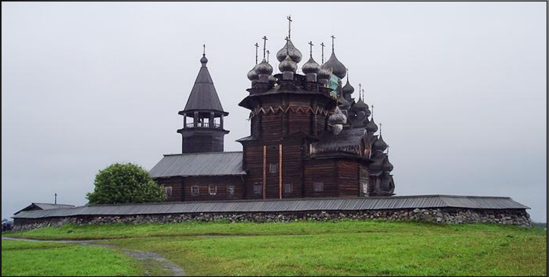
The Bell Tower of Kizhi