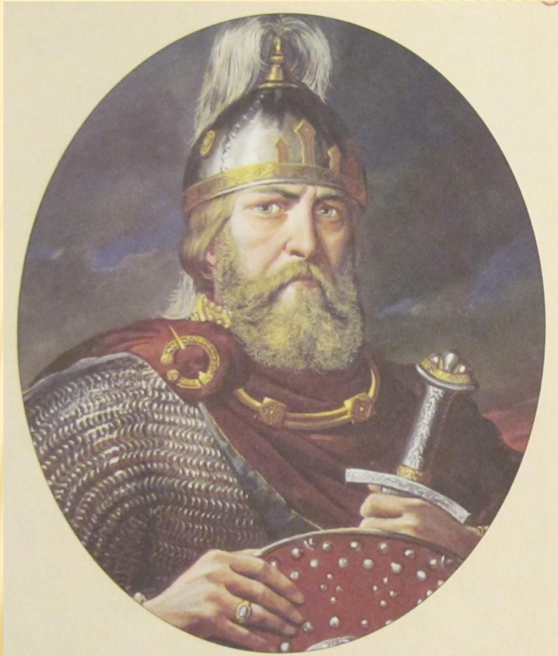
И. Глазунов Князь Рюрик

The first royal house in Russia was founded by Rurik, a Varangian.