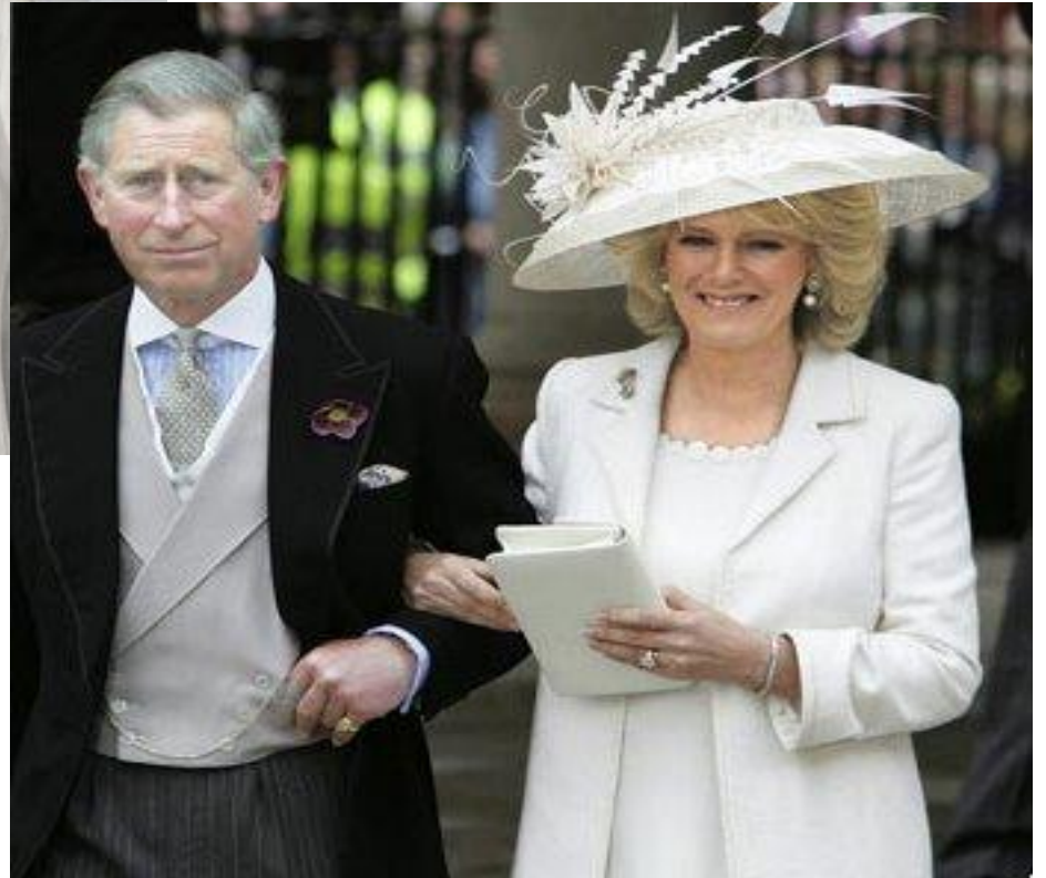
Charles Philip Arthur George and Camilla Parker Bowles