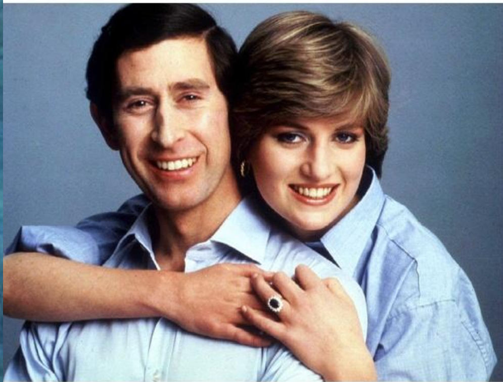
Charles Philip Arthur George and princess Diana