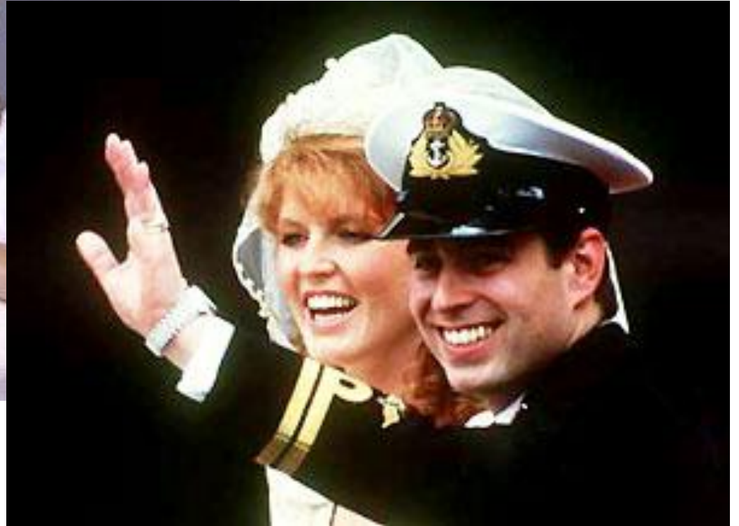
Andrew Albert Christian Edward and Sarah Ferguson