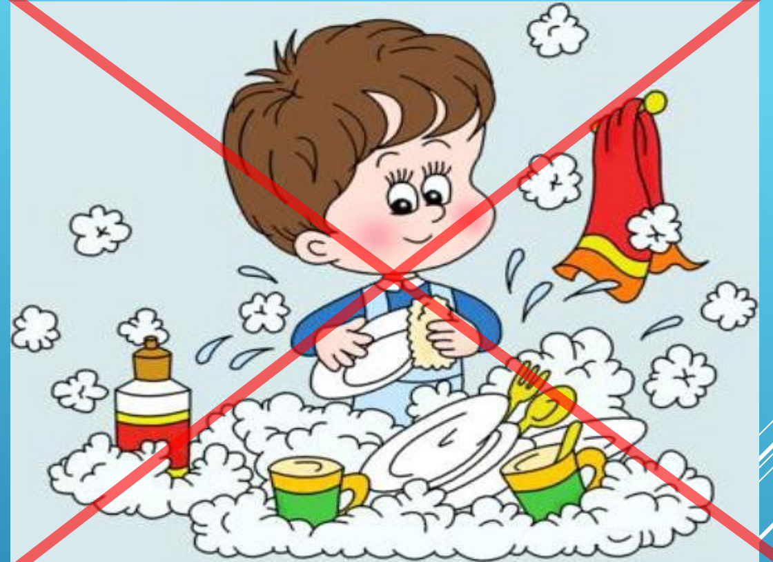
Dan never washes the dishes.