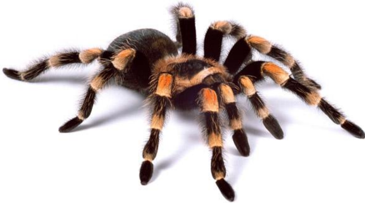
spider [sp ɑ ɪdə]