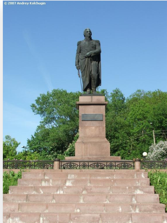
The monument to Kutuzov

These monuments devoted to the war with the Napoleon Army.