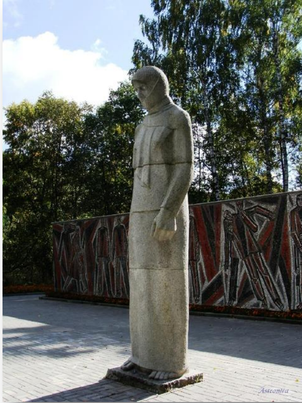
The monument “Mourning Mother”