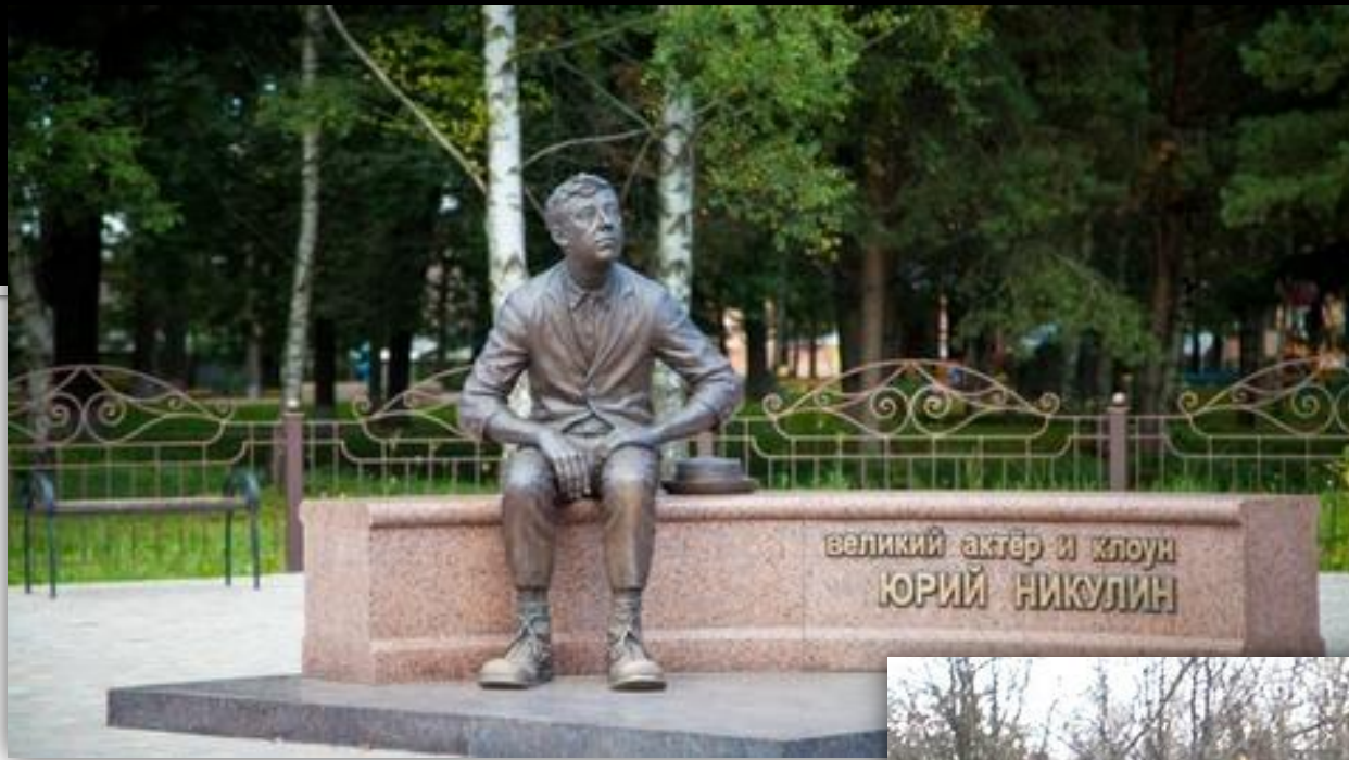
The monument to actor Nikulin