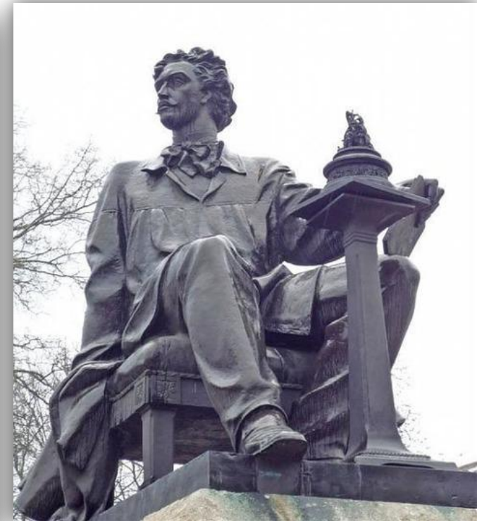
The monument to sculptor Mikeshin