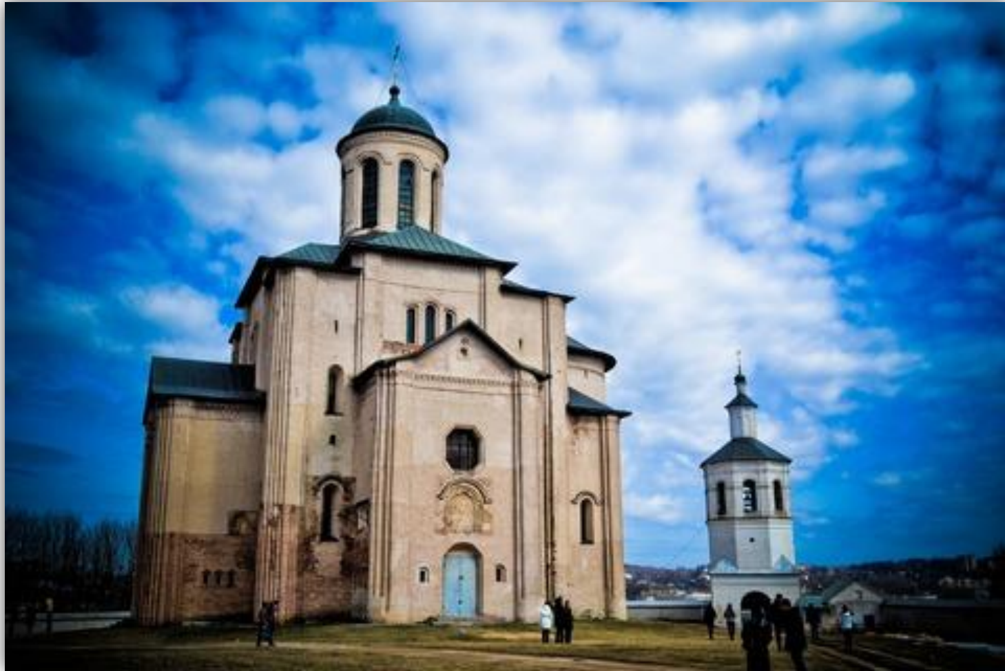
The Mikhail Archangel Church