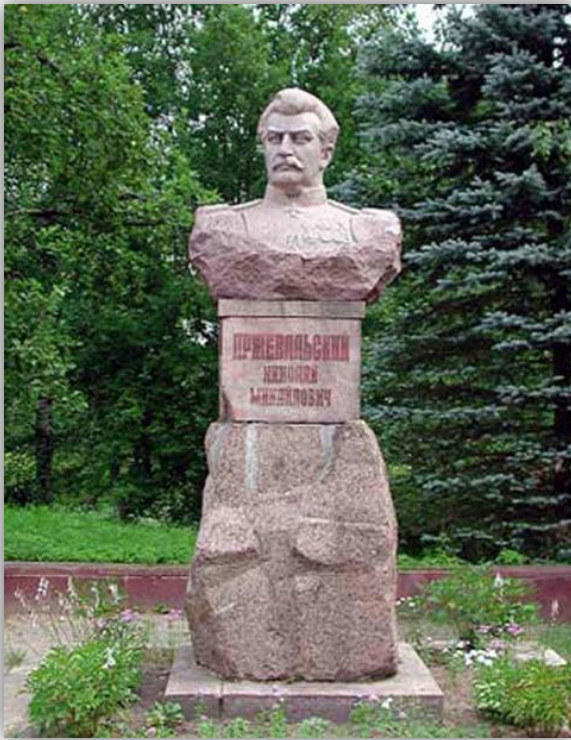
The monument to scientist Przhevalsky

Many-outstanding people were born in Smolensk and its region. There are many memorial places connected with their life in Smolensk.