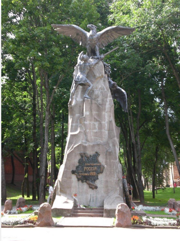
The monument with Eagles