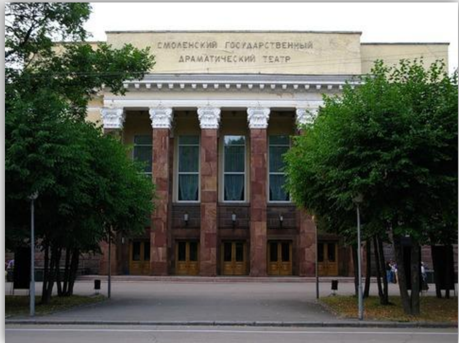
Smolensk State Drama Theatre