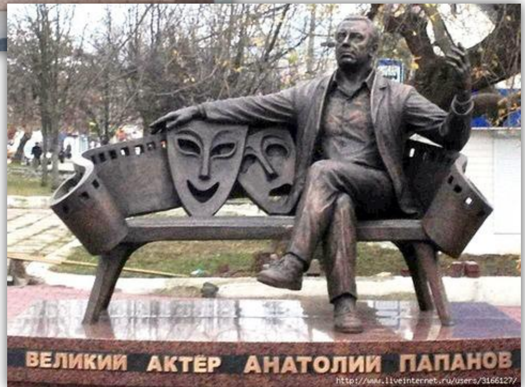
The monument to actor A. Papanov

http://www.liveinternet.ru/users/3166127/