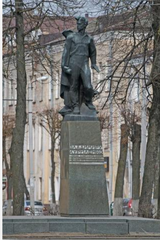
The monument to V. Kurilenko

These monuments devoted to people who fought heroically defending their Motherland.