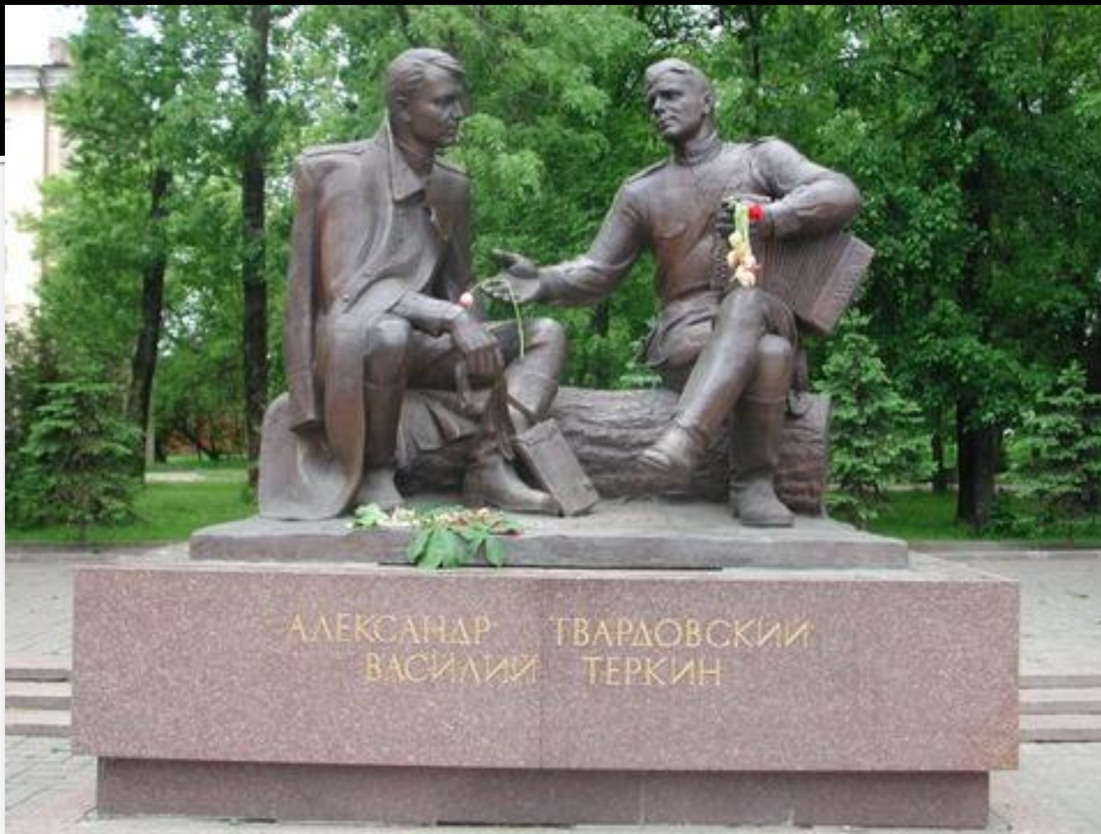
The monument to writer Tvardovsky