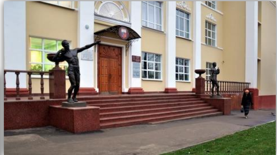
Academy of physical culture, sport and tourism