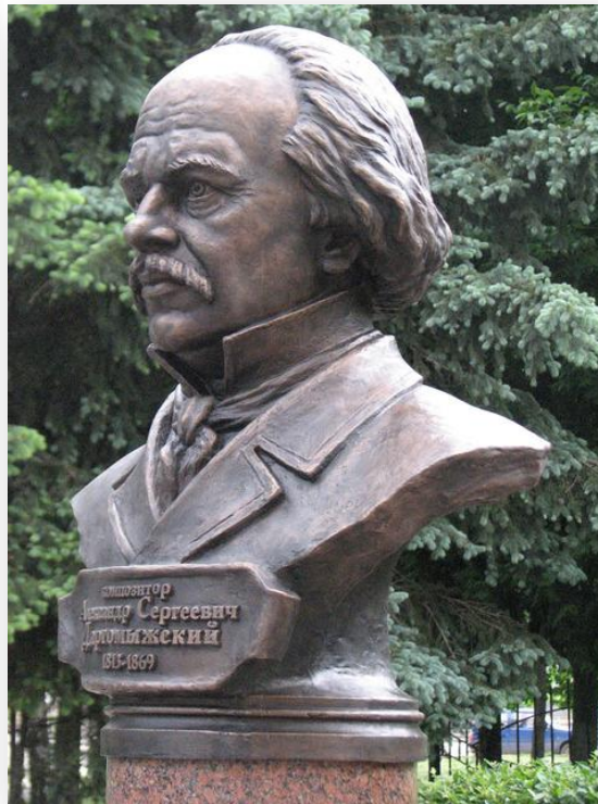
The monument to composer Dargomyzhsky