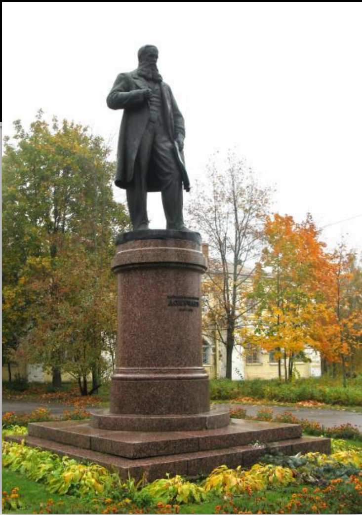
The monument to scientist Dokuchayev