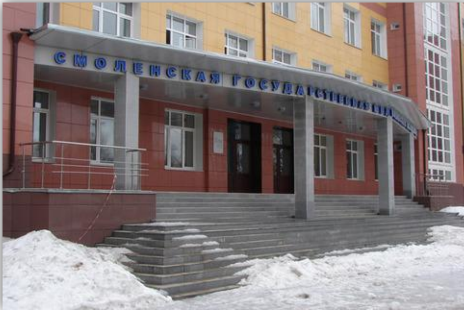
Smolensk state medical Academy

Today Smolensk is a modern regional centre; 340 thousand people live in it. There are many educational university in Smolensk.