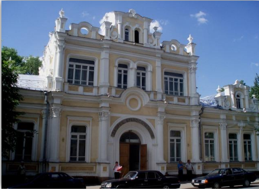
The House of Engelhardt