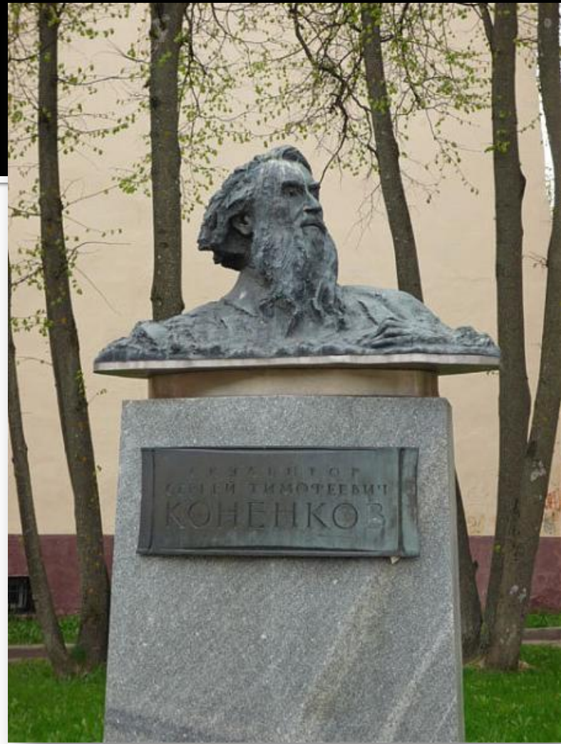
The monument to sculptor Konenkov