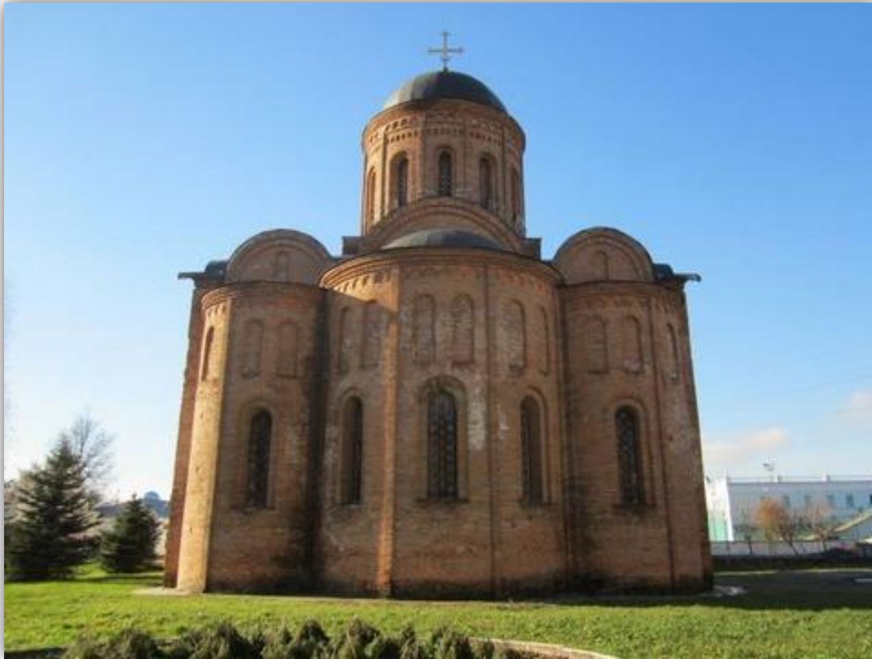
The Church of St.Peter and Paul