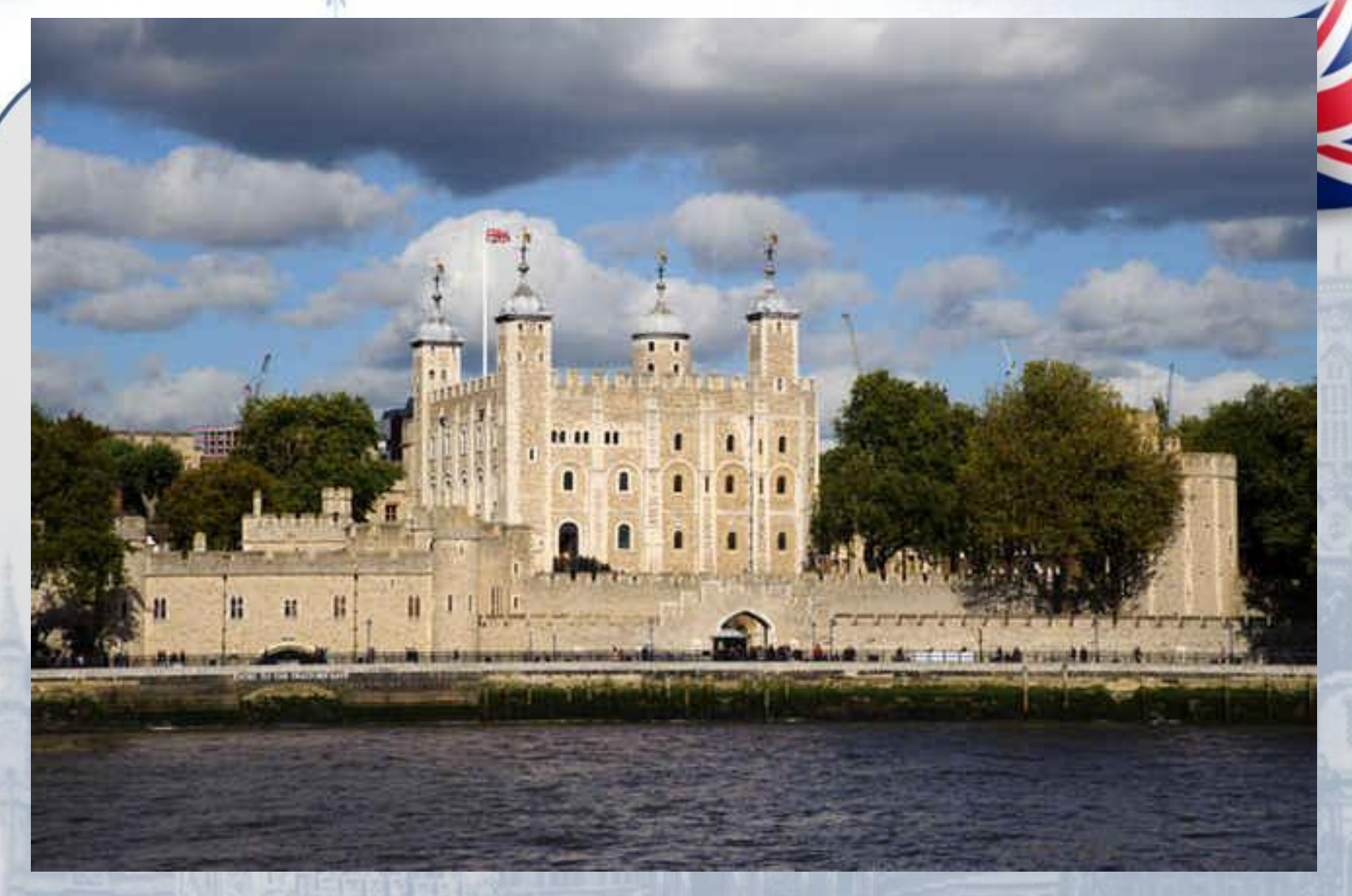
The Tower of London is a very big castle. It is a museum now.