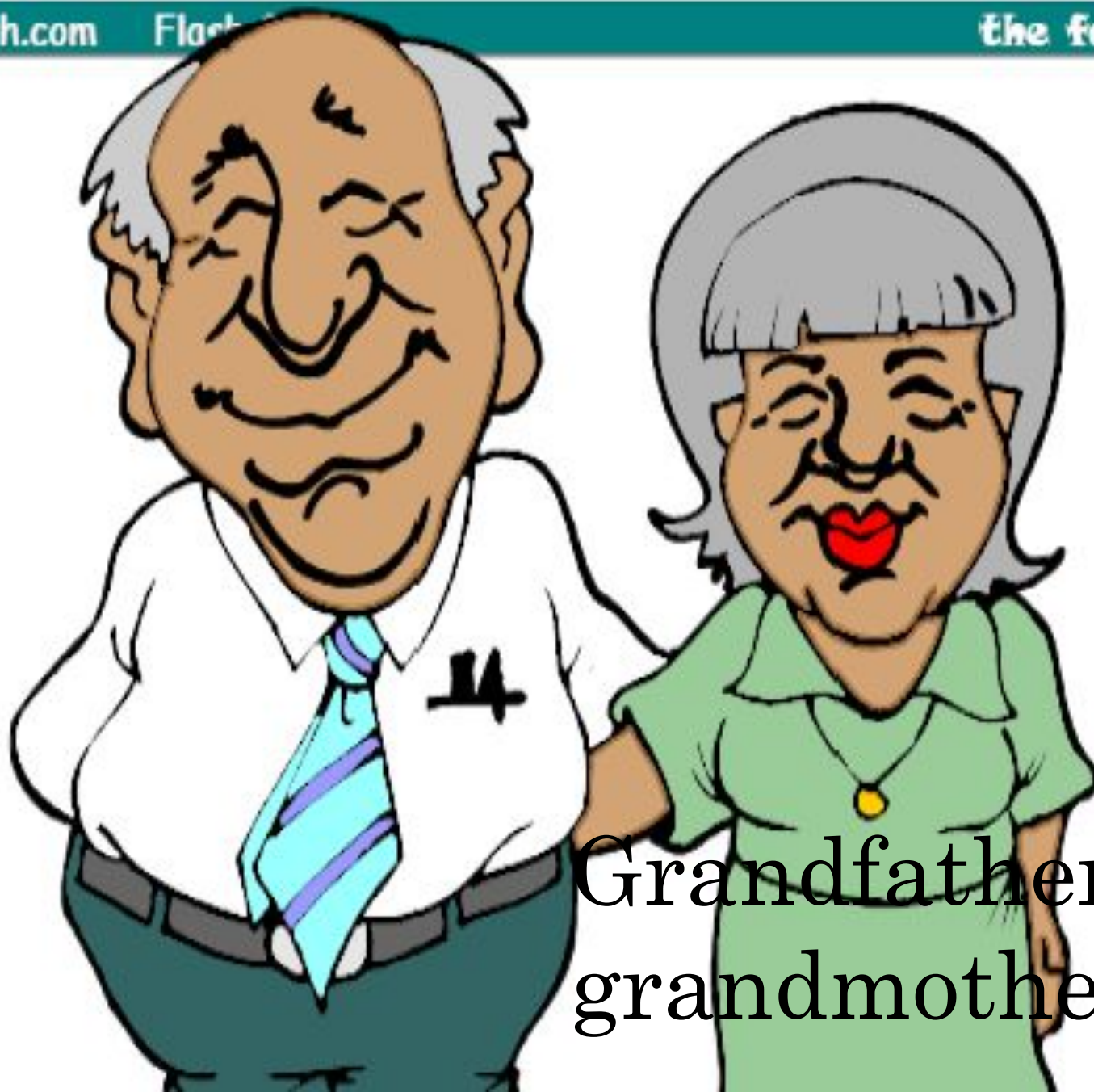
Grandfather and grandmother