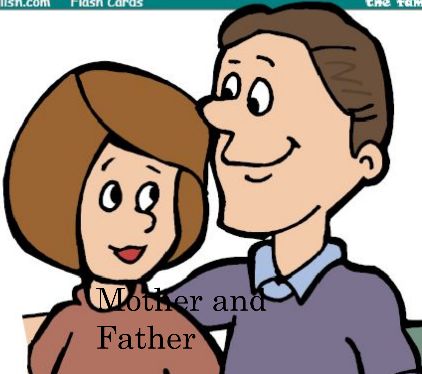
Mother and Father