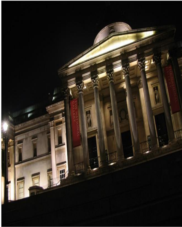
London. Trafalgar Square. 2007