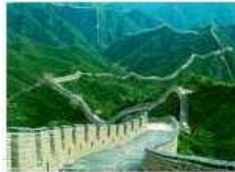
Great Wall of China