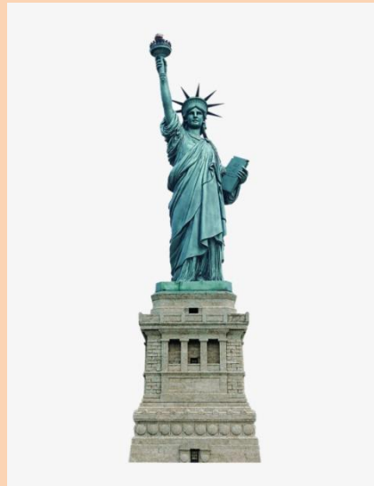
The Statue of Liberty Liberty Island