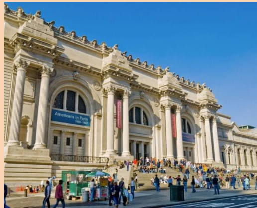
The Metropolitan Museum