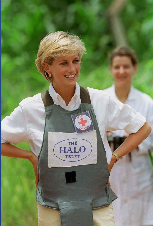
DIANA, PRINCESS OF WALES IN ANGOLA DURING A VISIT TO AN AREA BEING CLEARED OF MINES BY THE HALO TRUST