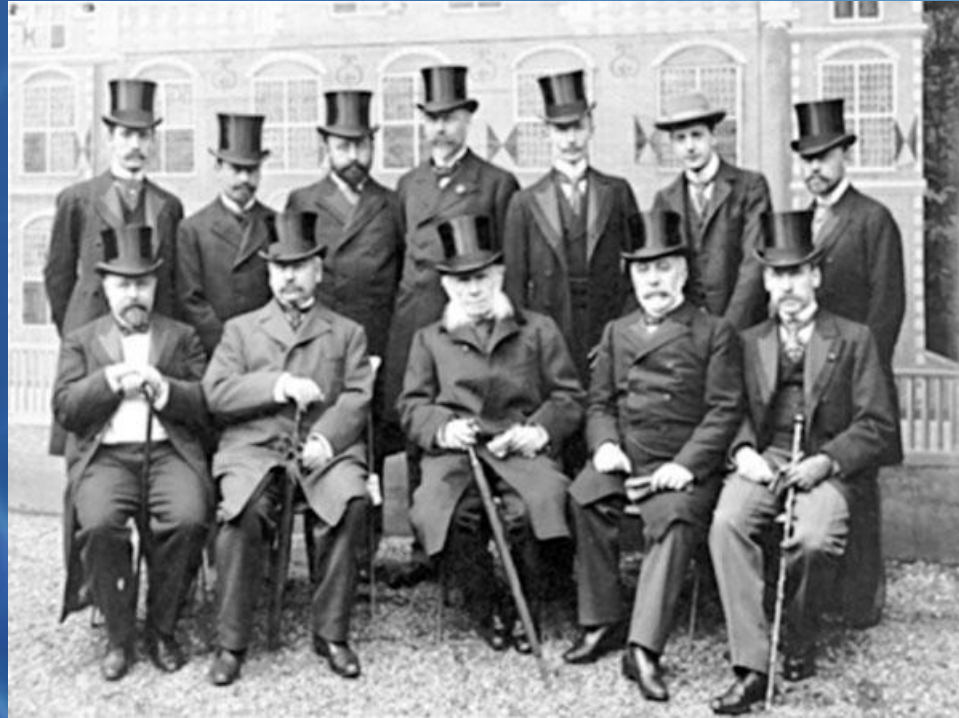
The Russian Delegation at the International Peace Conference.