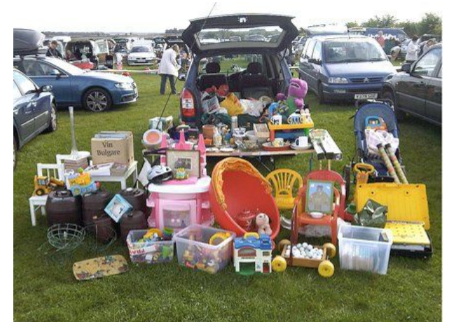
Car boot sale