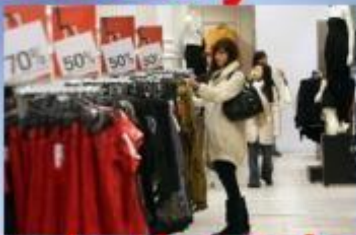
be in the sales