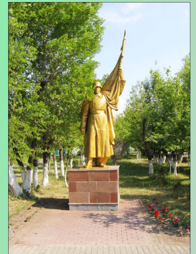
Soviet soldiers monument