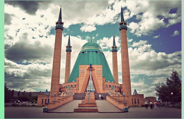
the mosque of Mashkhour Zhusup