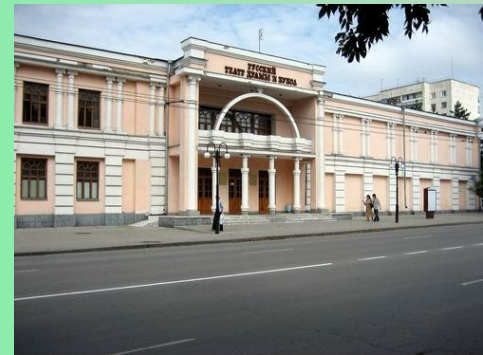
Kostanay city theater view