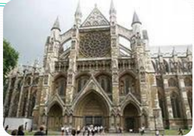
C. WESTMINSTER ABBEY