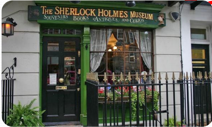
THE SHERLOCK HOLMES MUSEUM