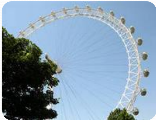
D. THE LONDON EYE