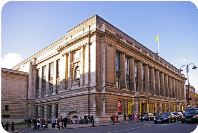
THE SCIENCE MUSEUM