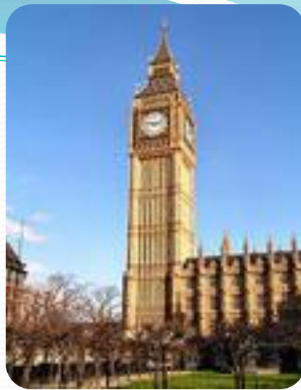
B. BIG BEN