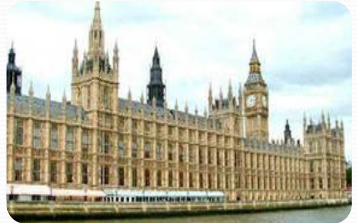
F. THE HOUSES OF PARLIAMENT