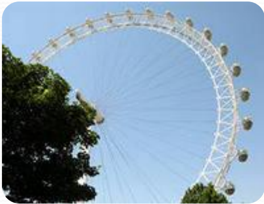
D. THE LONDON EYE