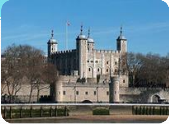
A. THE TOWER OF LONDON