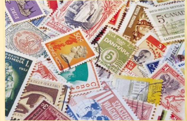
collectin g stamps