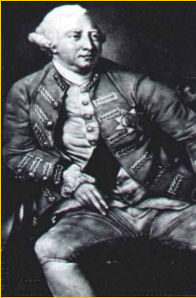
King George III.

The colonies were governed from England by the King George III. The governors of most of the colonies were appointed by The King himself.