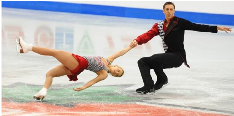
Figure skating | 'fɪgə 'sketɪŋ|