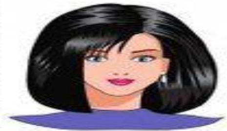
medium length black hair