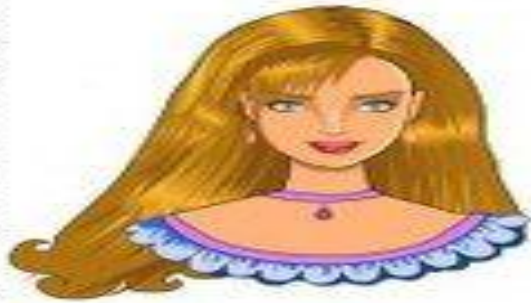
long blond hair