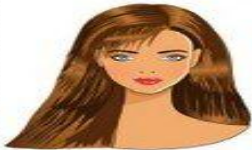
straight brown hair