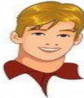
short blond hair