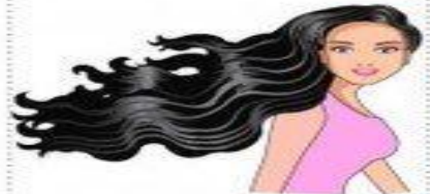
long wavy hair