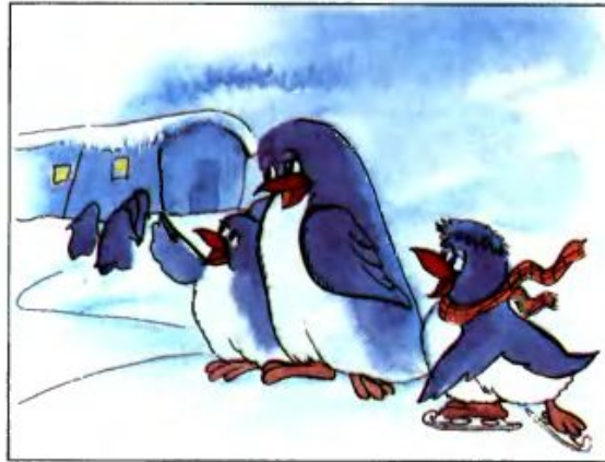
It's ... in Antarctica.