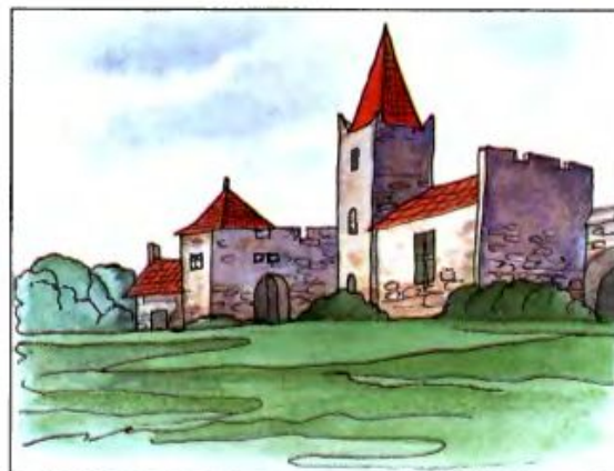
... in Britain.