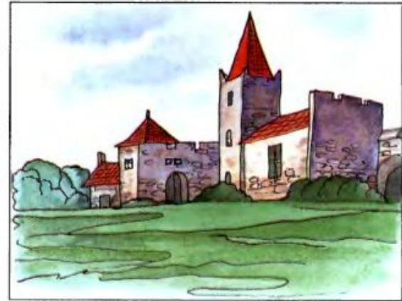
... in Britain.