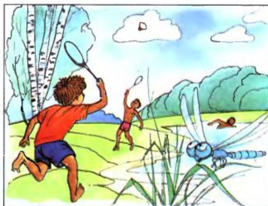
... in Russia.