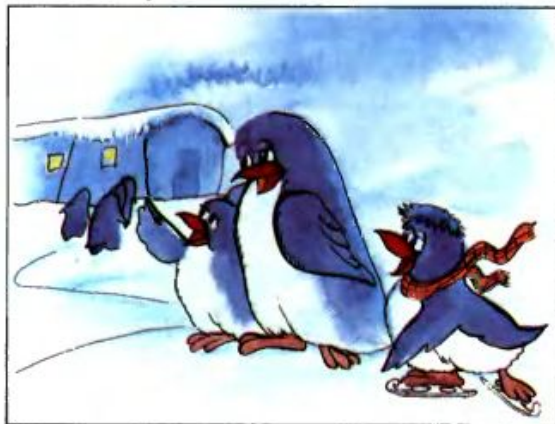
It's ... in Antarctica.