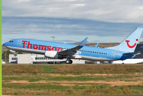
A Thomson Airways Boeing 737-800