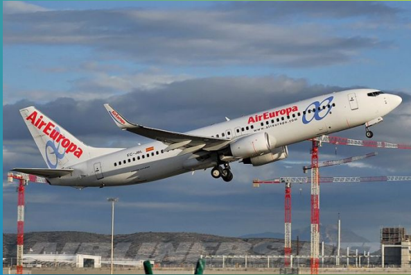
An Air Europa Boeing 737-800