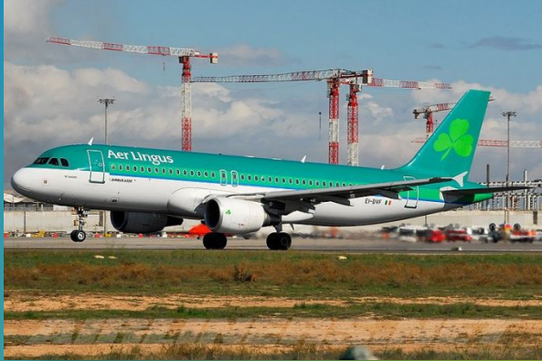
An Aer Lingus Airbus A320-200