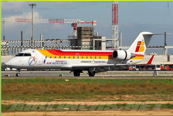
An Air Nostrum Canadair CL-600-2B19