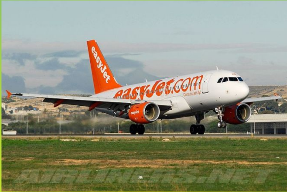
An EasyJet Airbus A319-100