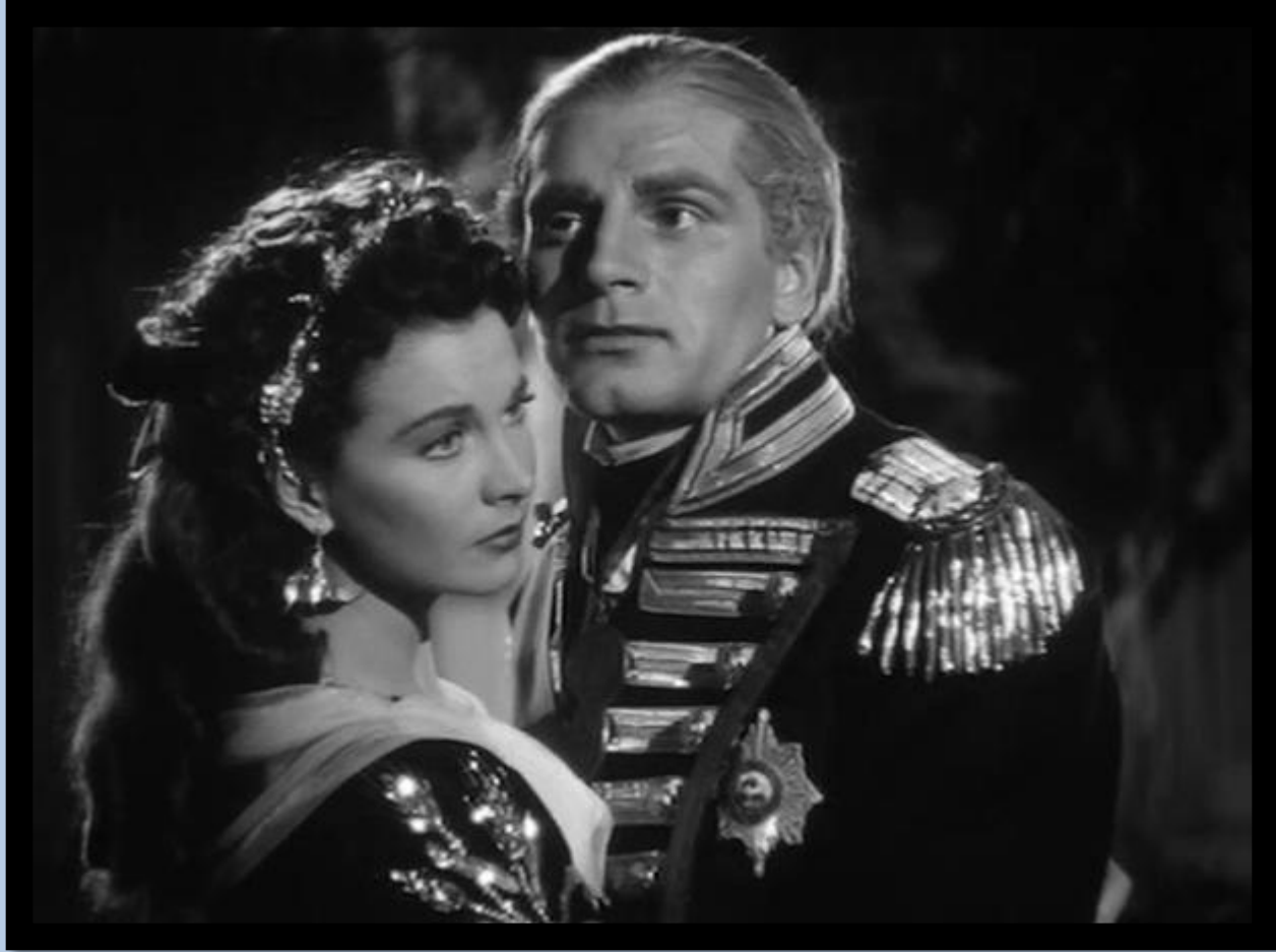
Laurence Olivier and Vivien Leigh