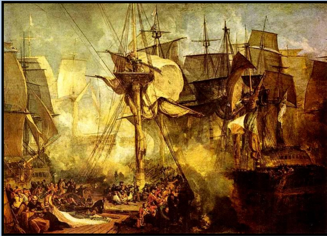
Joseph Mallord William Turner

On 21 st of October 1805 Nelson won the Battle near the Cape of Trafalgar.