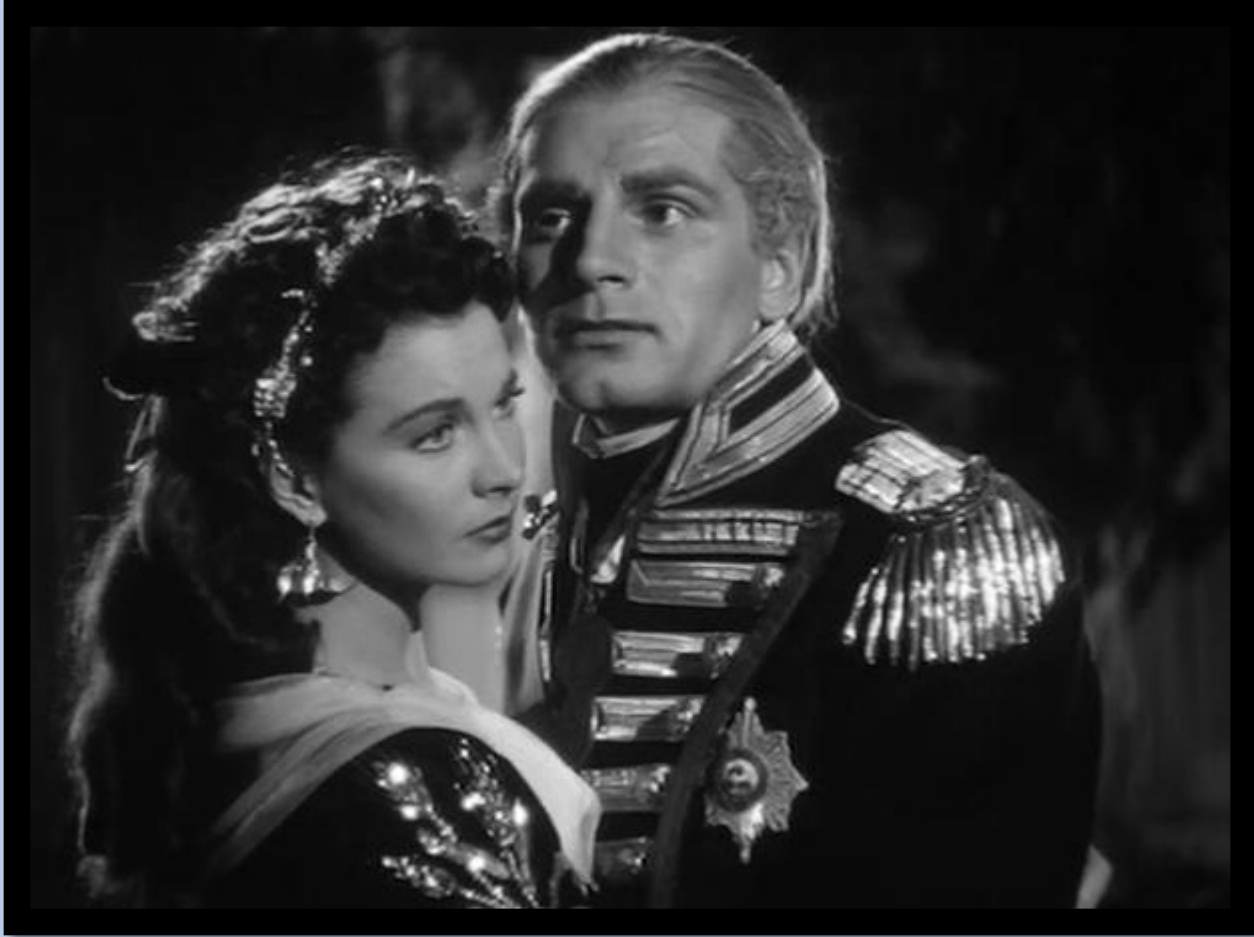
Laurence Olivier and Vivien Leigh