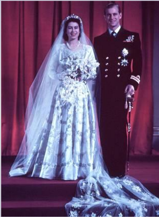
Свадьба принцессы Елизаветы и графа Эдинбургского в 1947 году.