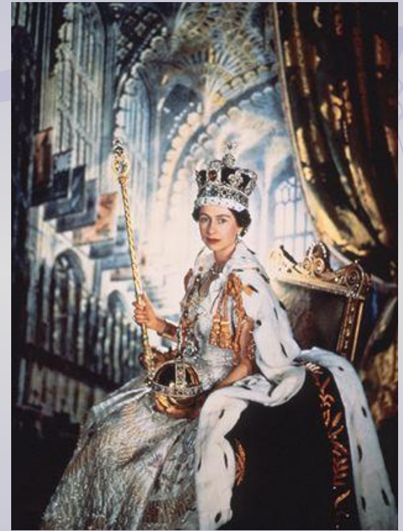
Коронация Елизаветы II в 1953 году.