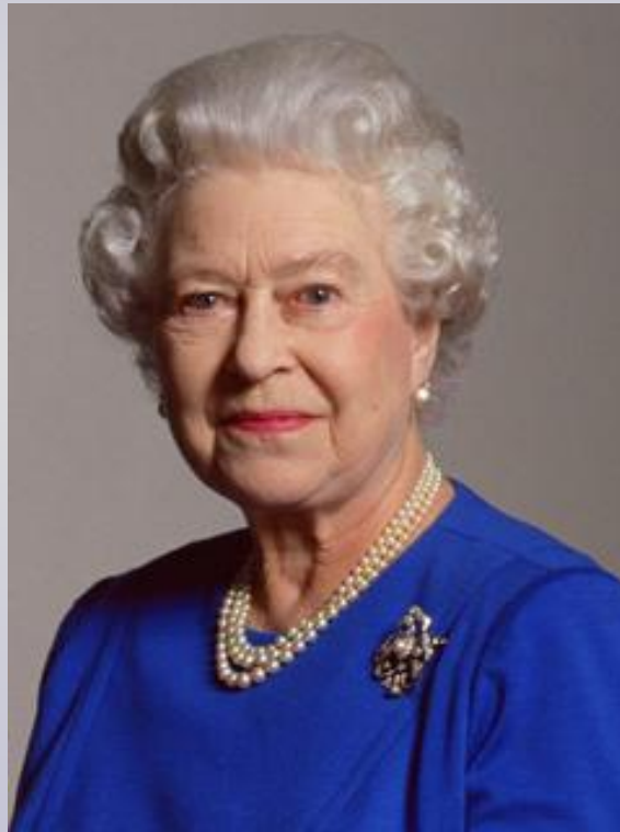
Королева Елизавета II на свое 80- летие в 2006 году.