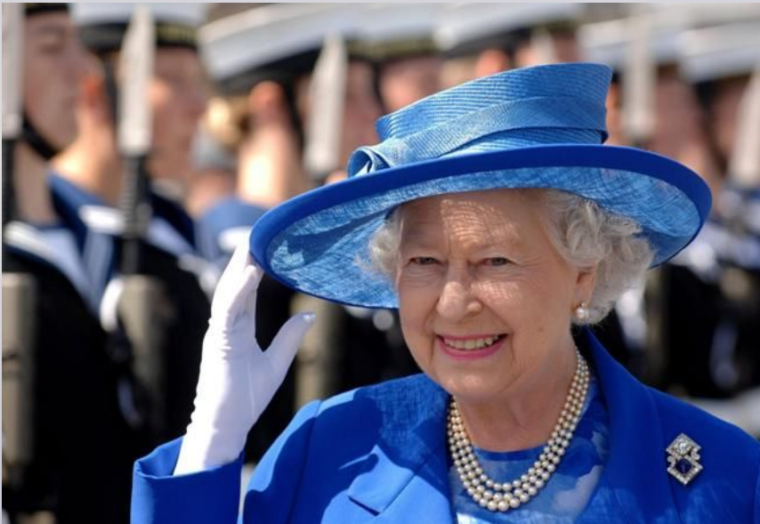
Elizabeth Alexandra Mary

The Monarch is the official head of state and the Commonwealth of nations