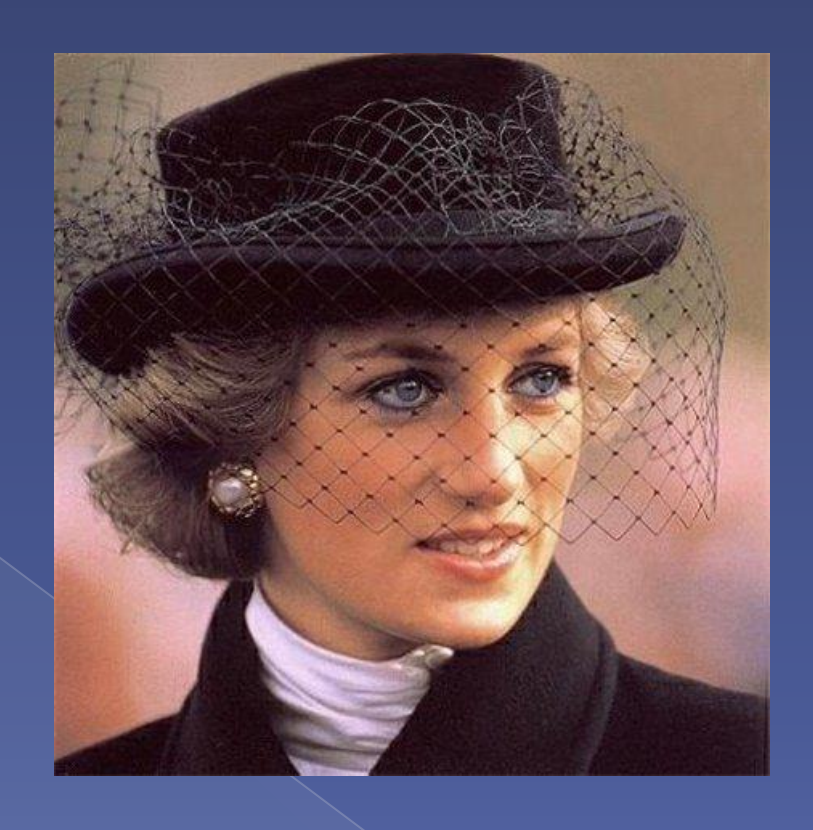
Lady Diana who was involved in charities and created a new image of a royal.