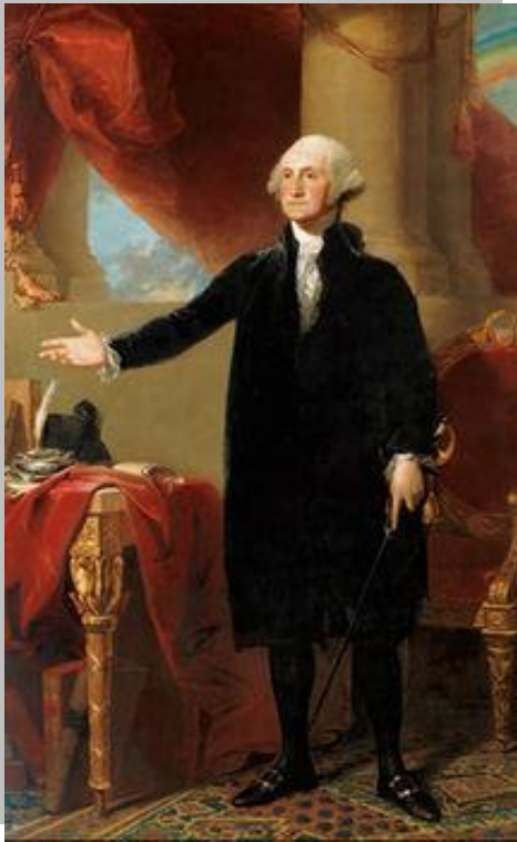
George Washington (1732-1799)

This holiday was created to celebrate the deeds of two legendary American Presidents