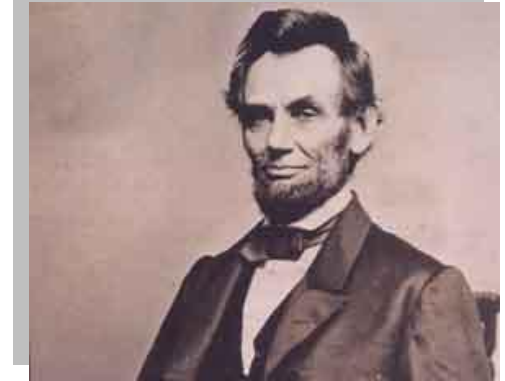
Abraham Lincoln (1809-1865)

During the War of Independence he took command of the Continental Army for eight years, until colonies won their independence from Britain.