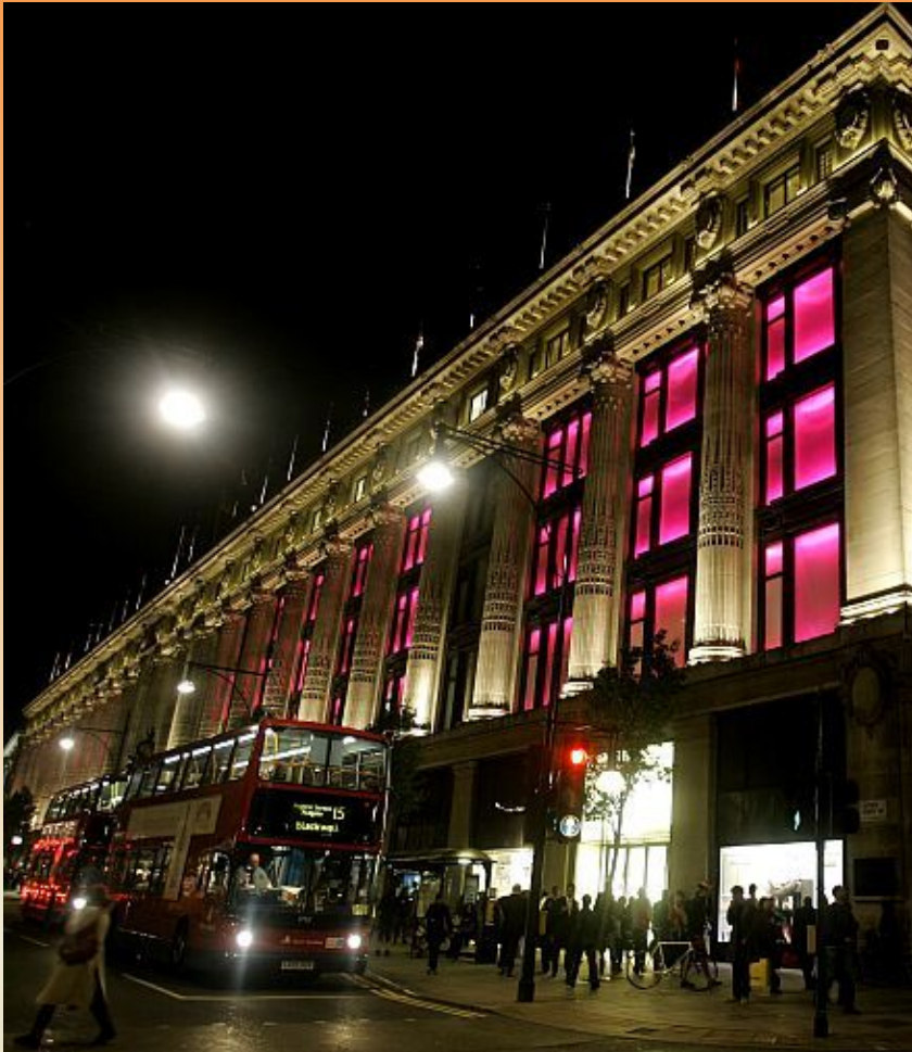
S e f r i d g e s