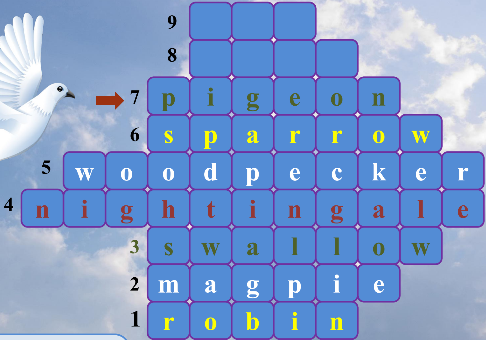
a grey or white bird which often lives on buildings in towns