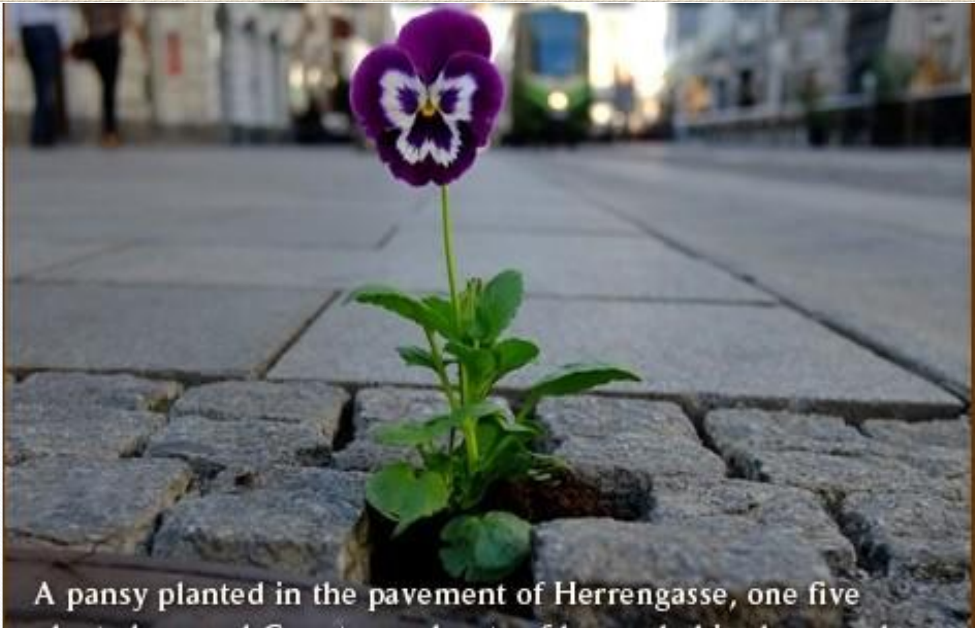
A pansy planted in the pavement of Herrengasse, one five