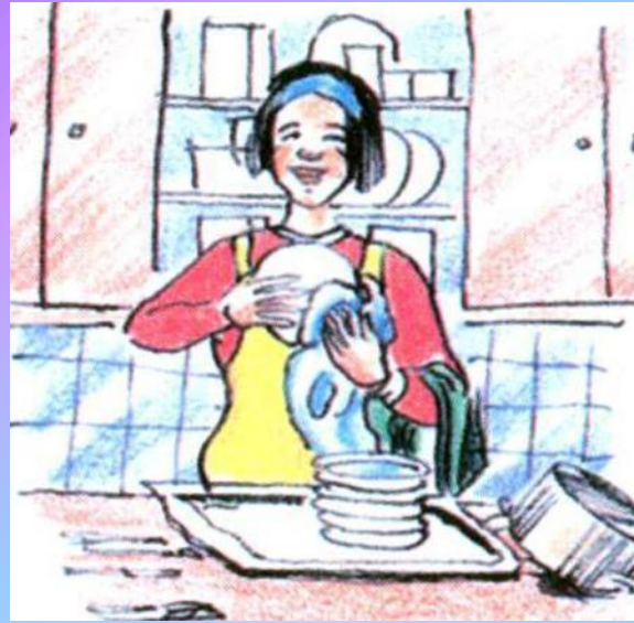
5. a housewife [hauswaif]