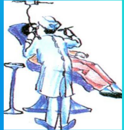
3. a dentist [ˈdentɪst]