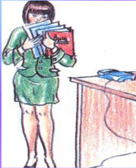
4. a secretary [ˈsekritəri]