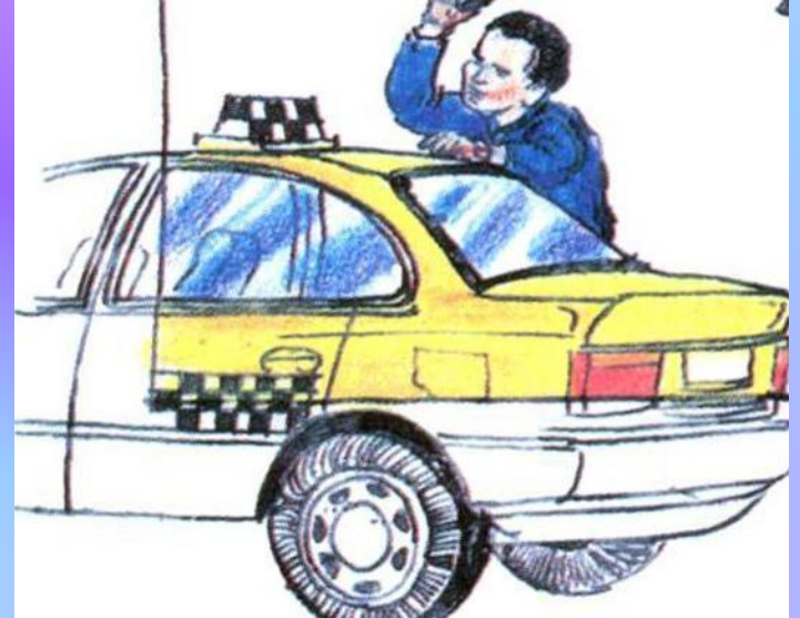
10. a driver [draɪvə]