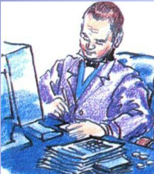
7. a bank manager [bæŋk mænɪdʒə]