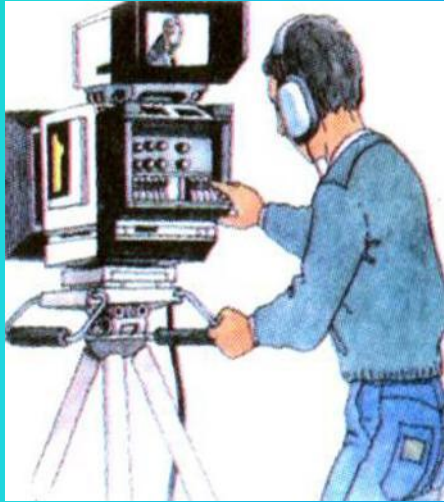
1. an operator [ɔˈpɪreɪtə]