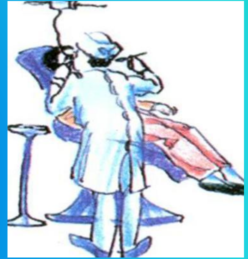
3. a dentist [ˈdentɪst]