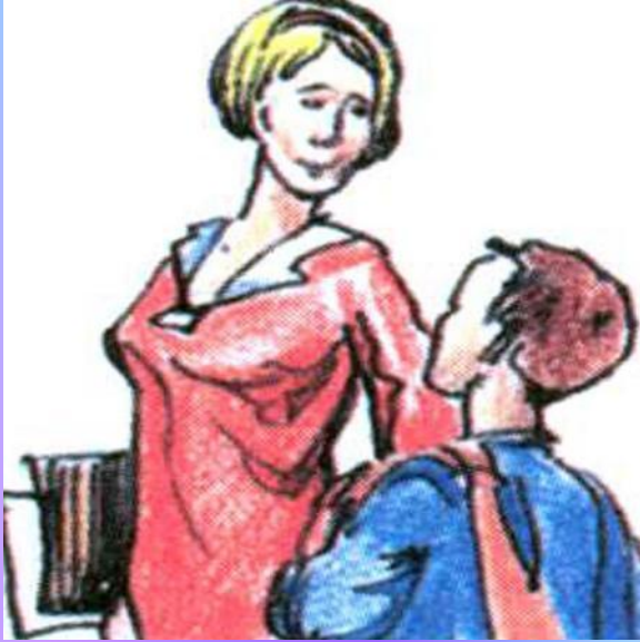
9. a teacher [ˈti:tʃ ə]