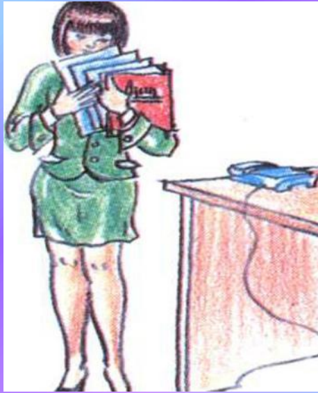
4. a secretary [ˈsekritəri]