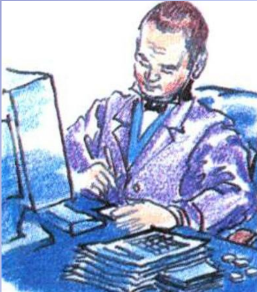
7. a bank manager [bæŋk mænɪdʒ ə]