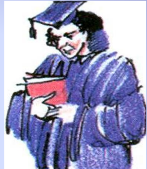
8. a lawyer [ˈlɔːjə]