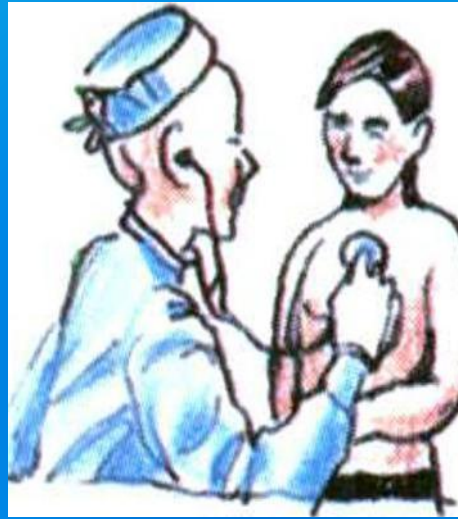
2. a doctor [ˈdɔktə]