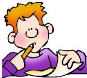
Writing a Story