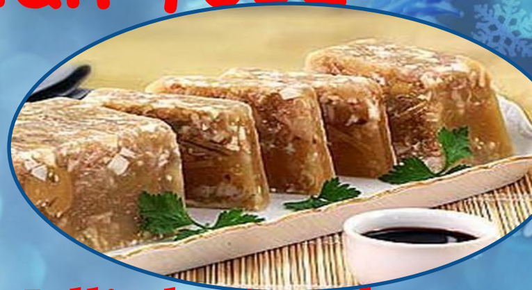
Jellied minced meat