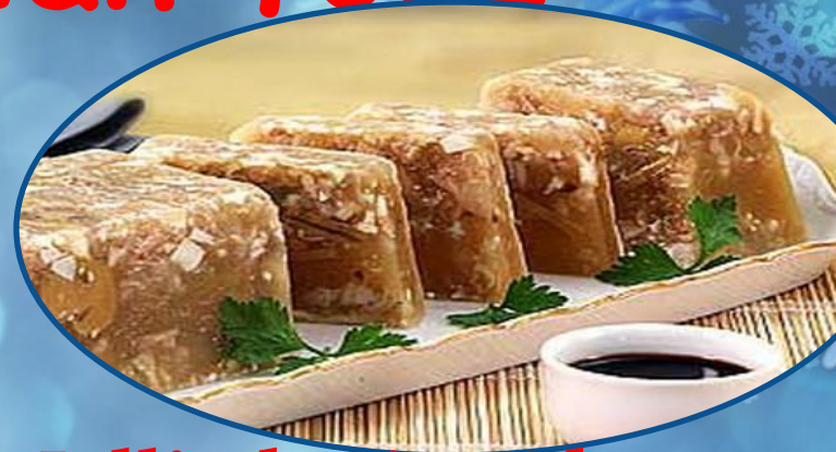
Jellied minced meat