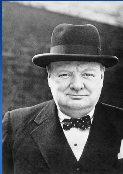
Sir Winston Churchill