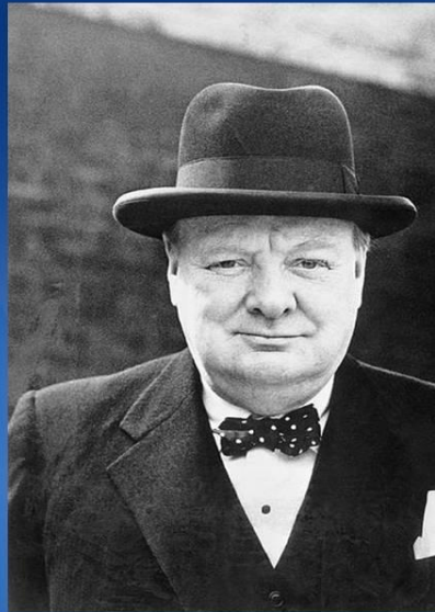
Sir Winston Churchill