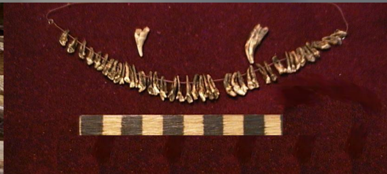
Necklace of fox teeth