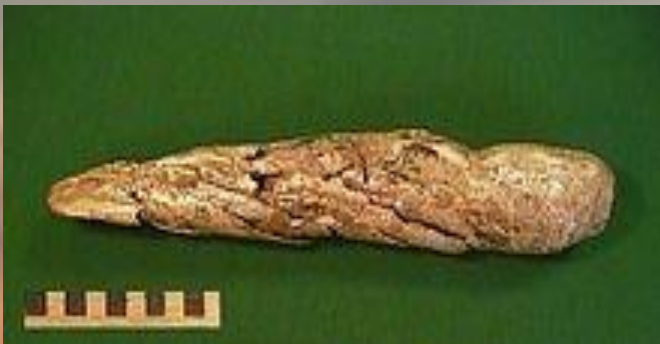
Mammoth bone tool

Zaraysk parking is monument of world importance. it is located in the Moscow region. But burial is not discovered and impossible to judge how it looks on the outside Zaraisky typical CRO-magnon.