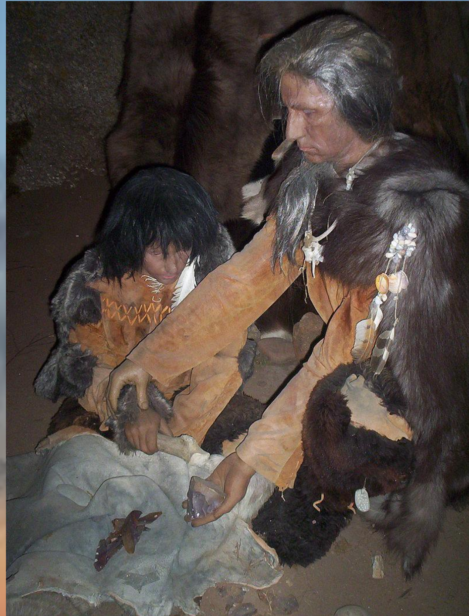
Reconstruction of a Cro-Magnon. woman and child

The main occupation of the Upper Volga cultures were hunting and harpoon fisheries. Their dwellings according to type of tents.