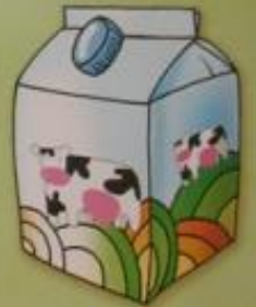
a carton of milk