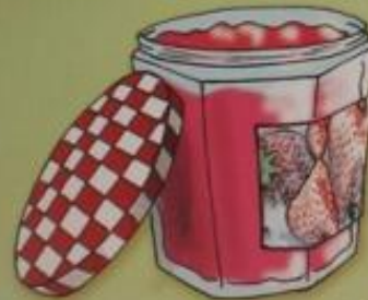
a jar of jam