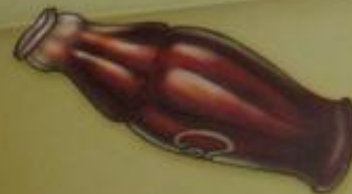
a bottle of Coke