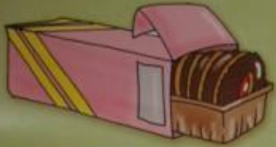
a packet of biscuits