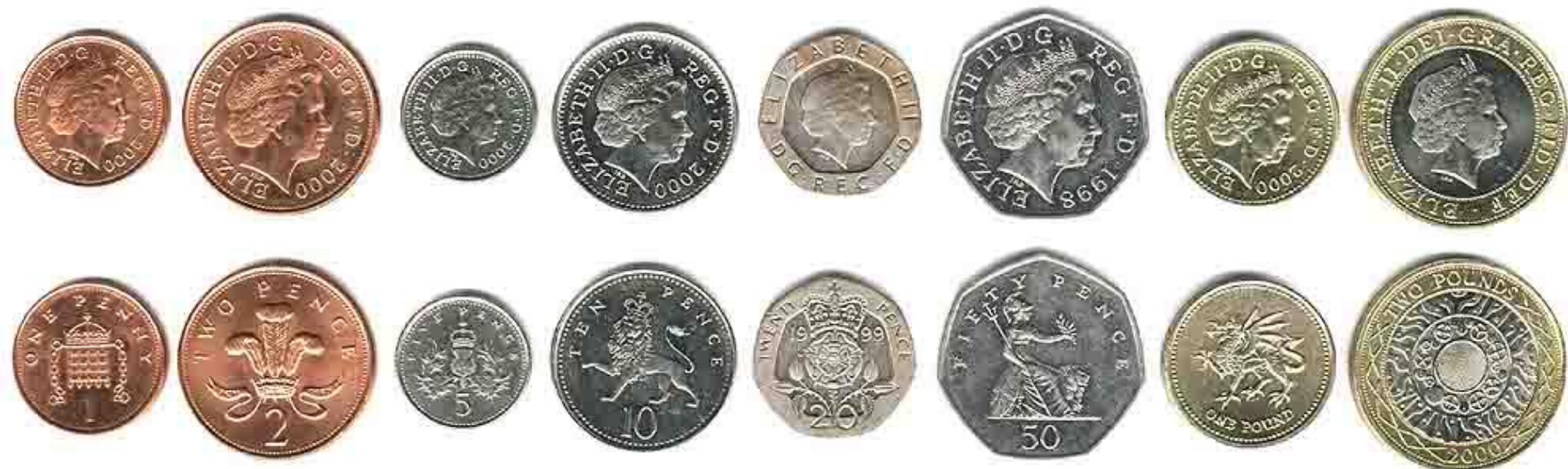
1 penny 2 pence 5 pence 10 pence 20 pence 50 pence 1 pound 2 pounds