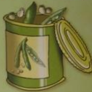
a tin of beans