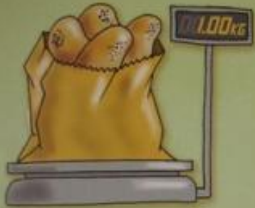
a kilo of potatoes