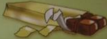
a bar of chocolate