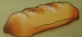
a loaf of bread