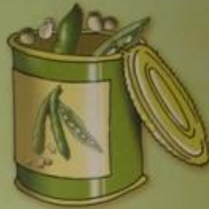
a tin of beans