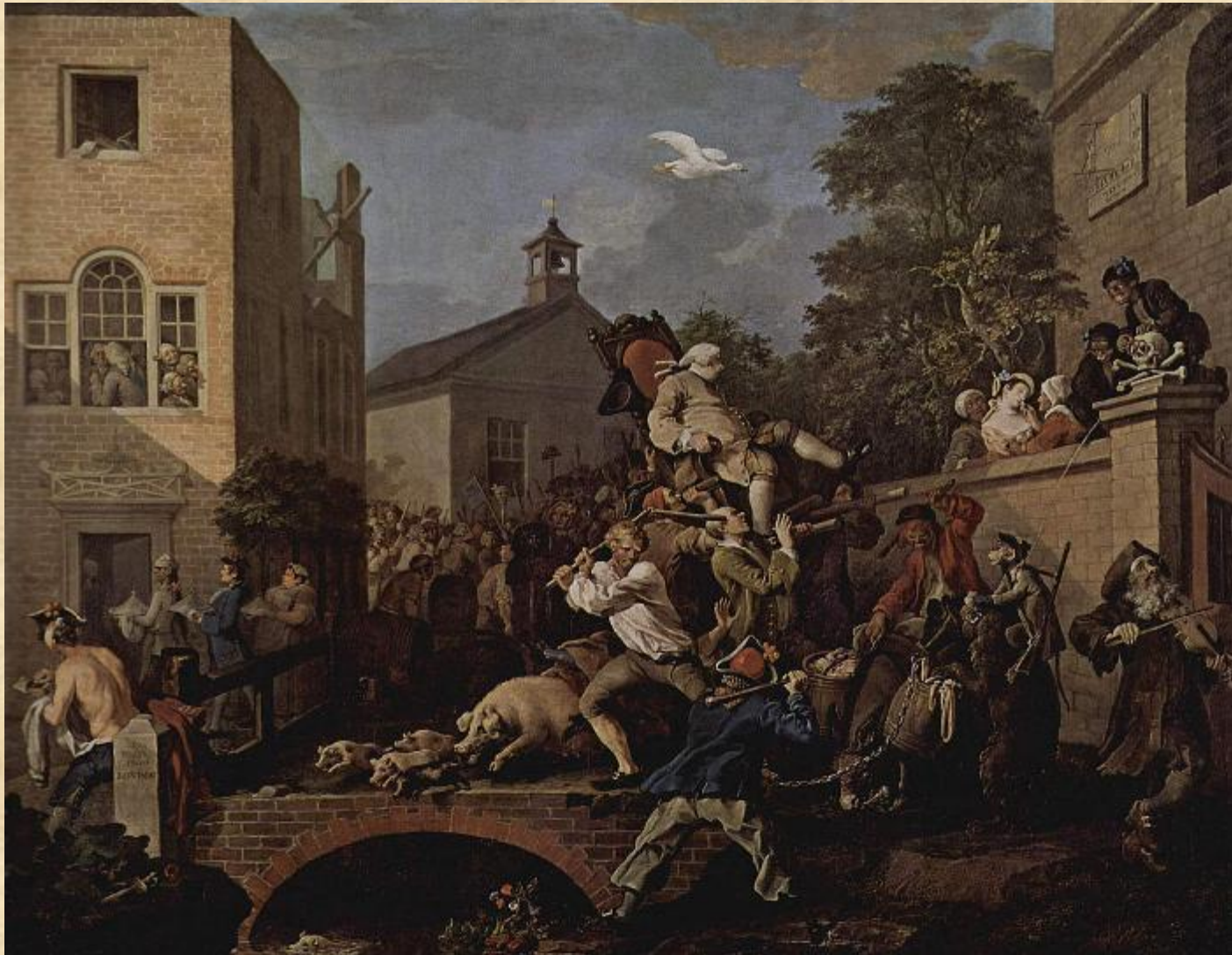
“The Election Entertainment” (Выборы)