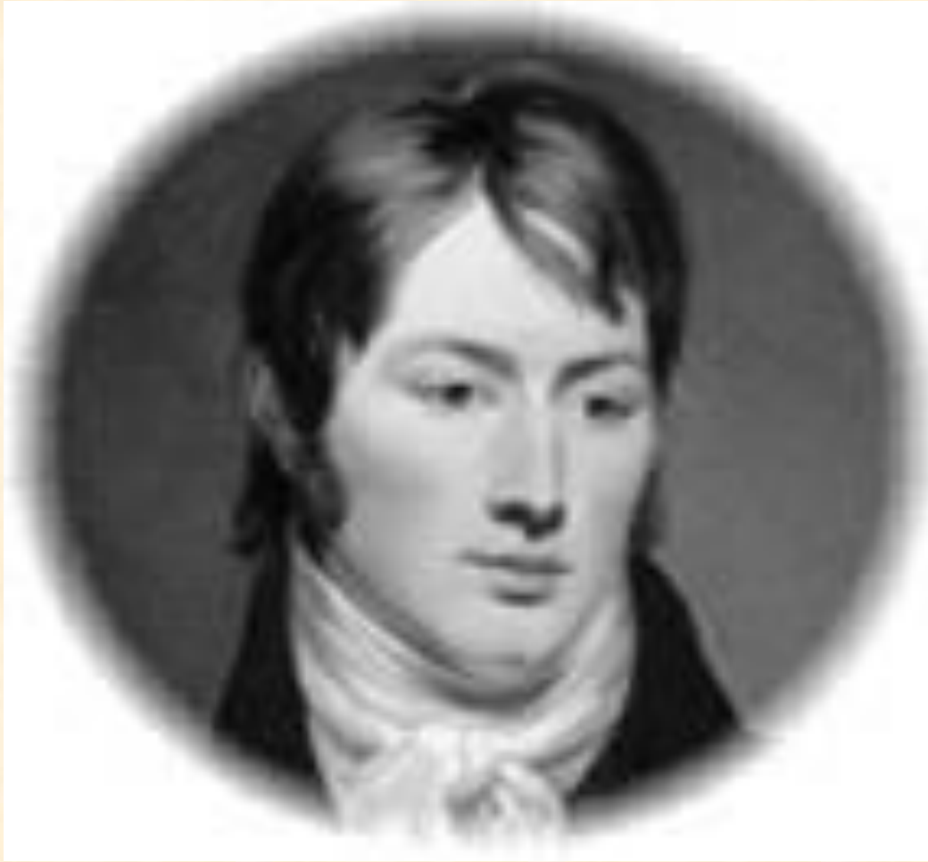
John Constable (1776-1837 )