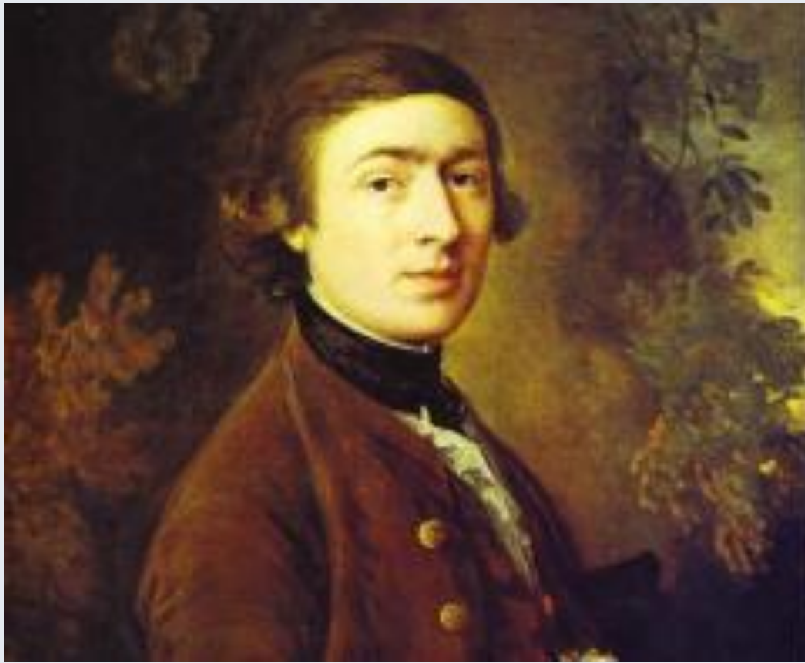
Thomas Gainsborough (1727-1788)