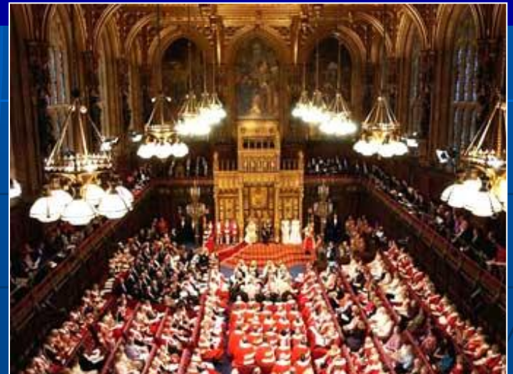
the House of Commons