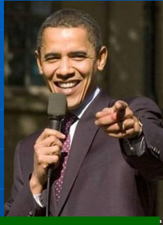
B. Obama a real president since January 2009.

The President must be native-born American, at least 35 years old and must have lived in the USA for at least 14 years.