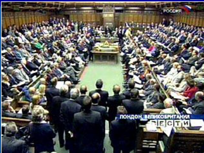
the House of Lords

The legislative branch of power is exercised by the Houses of Parliament which consists of two chambers: