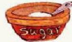
a bowl of sugar