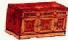
a piece of furniture