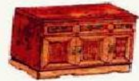
a piece of furniture