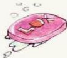
a bar of soap