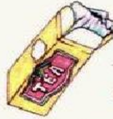
a packet of tea