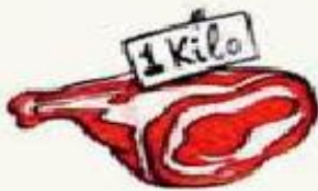
a kilo of meat