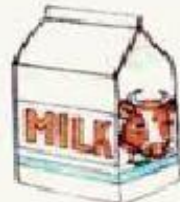
a carton of milk