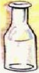
a bottle of milk

Some uncountable nouns can be made countable by using these words: