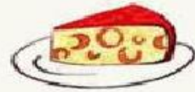
a piece of cheese