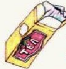
a packet of tea