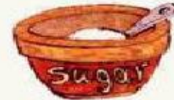
a bowl of sugar