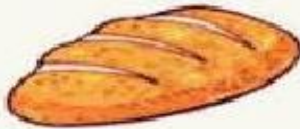
a loaf of bread