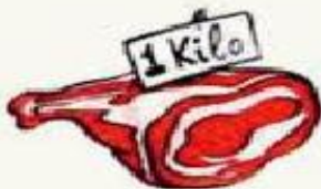
a kilo of meat