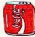
a can of Coke