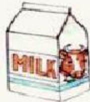
a carton of milk