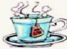
a cup of tea