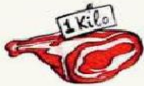
a kilo of meat