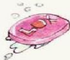
a bar of soap