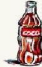
a bottle of Coke