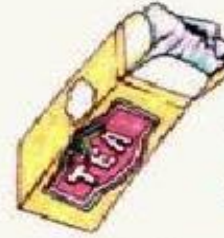
a packet of tea