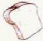
a slice of bread