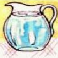
a jug of water