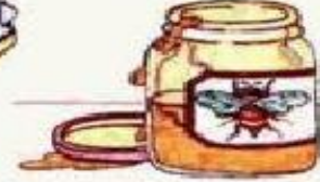
a jar of honey