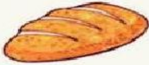
a loaf of bread