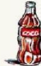
a bottle of Coke