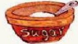
a bowl of sugar