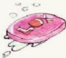
a bar of soap