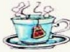
a cup of tea