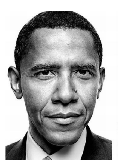
Barack Obama President, United States Born August 4, 1961 In office since January 20, 2009