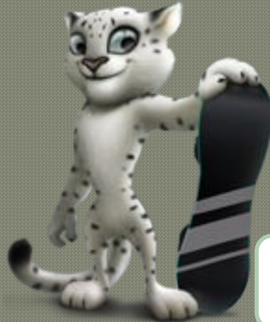
A Snow Leopard