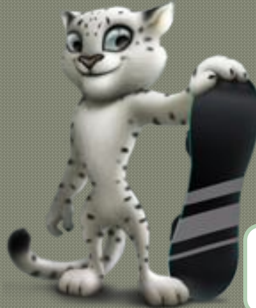
A Snow Leopard