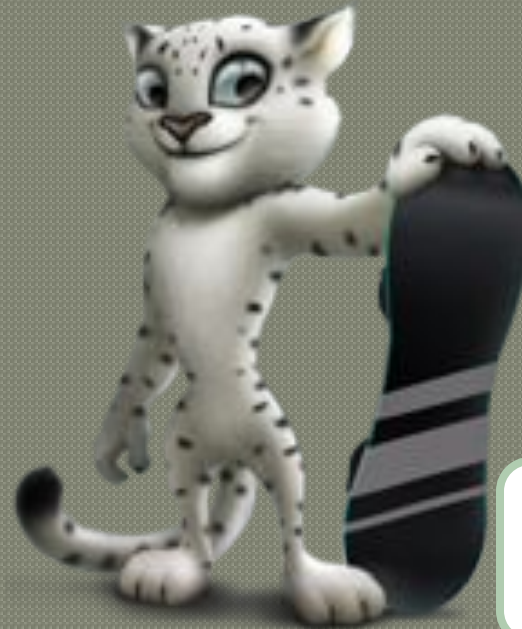
A Snow Leopard