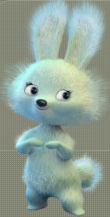
A White Hare