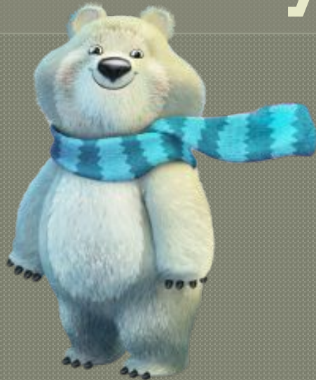
A White Bear