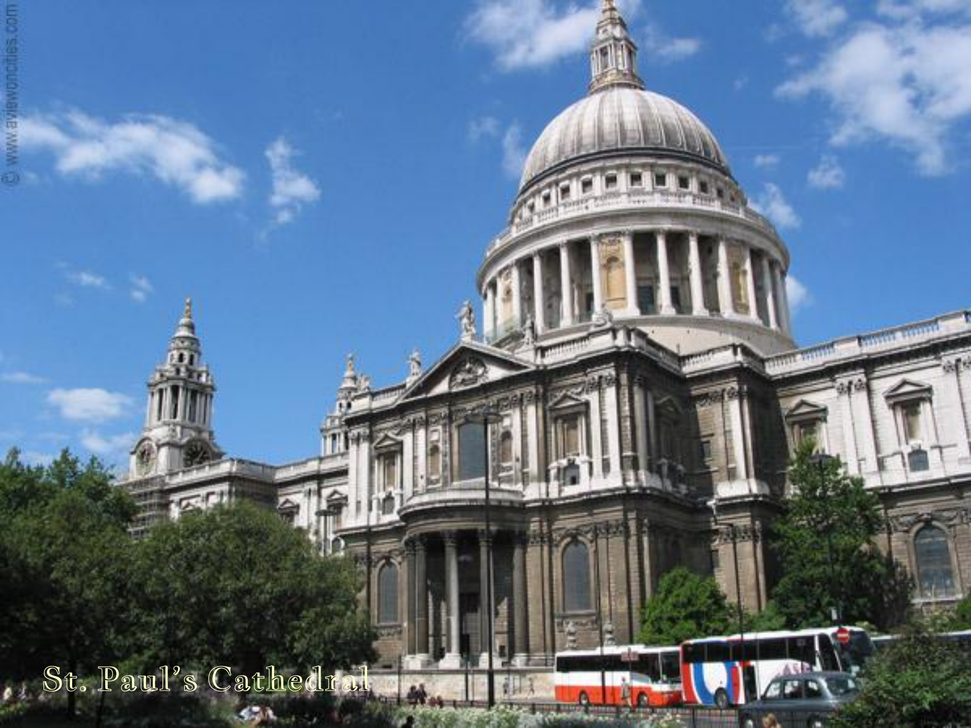
St. Paul's Cathedral