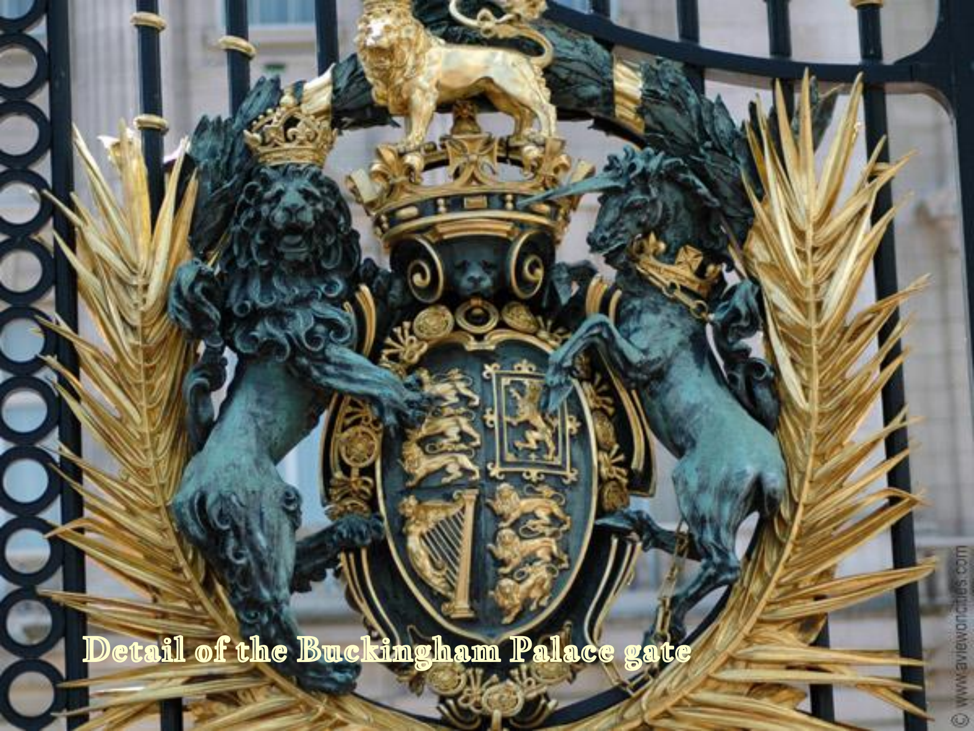
Detail of the Buckingham Palace gate