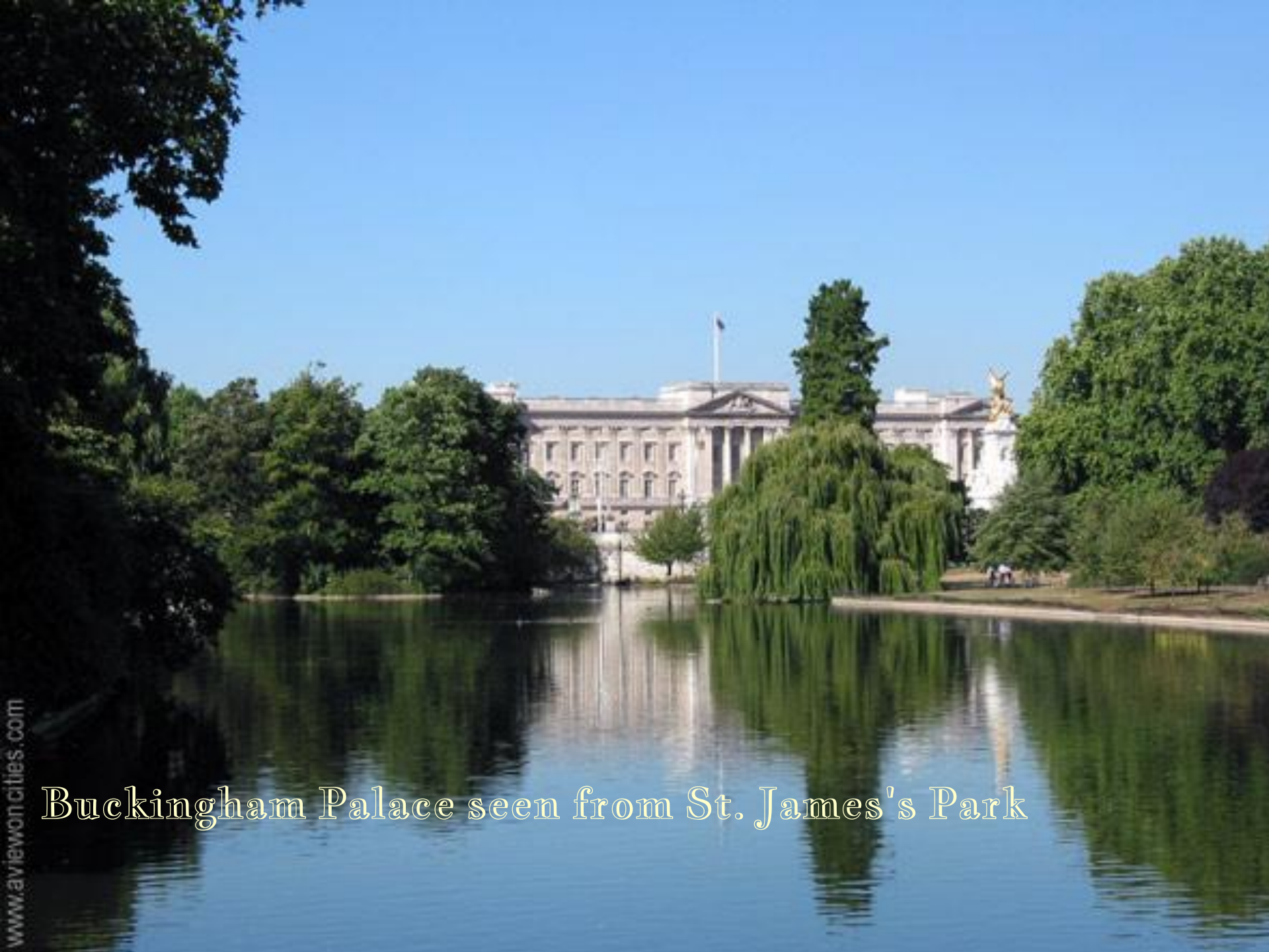
Buckingham Palace seen from St. James's Park