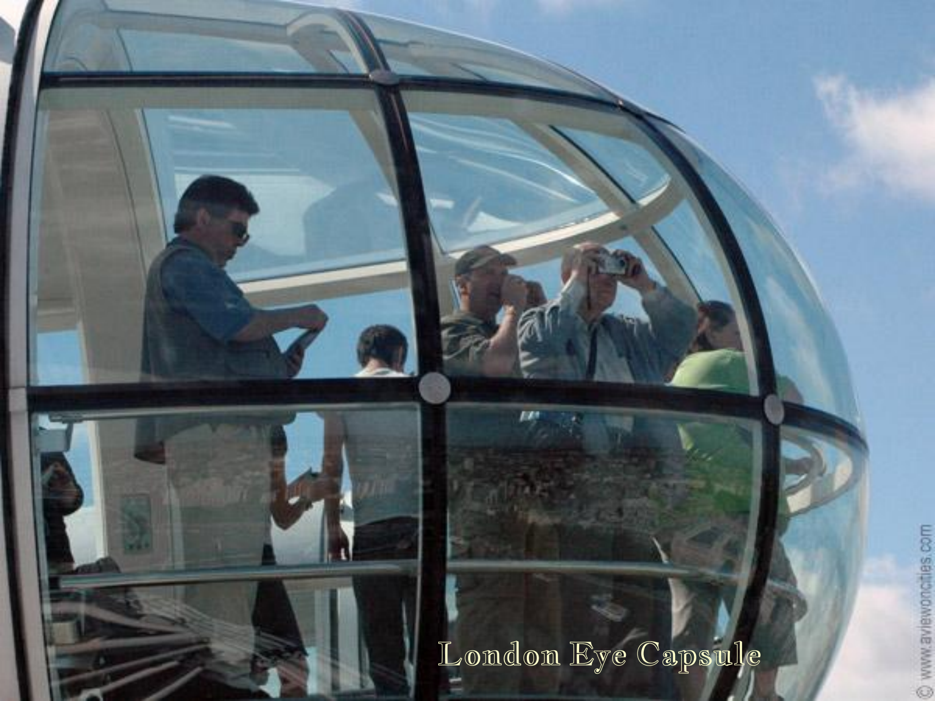
London Eye Capsule