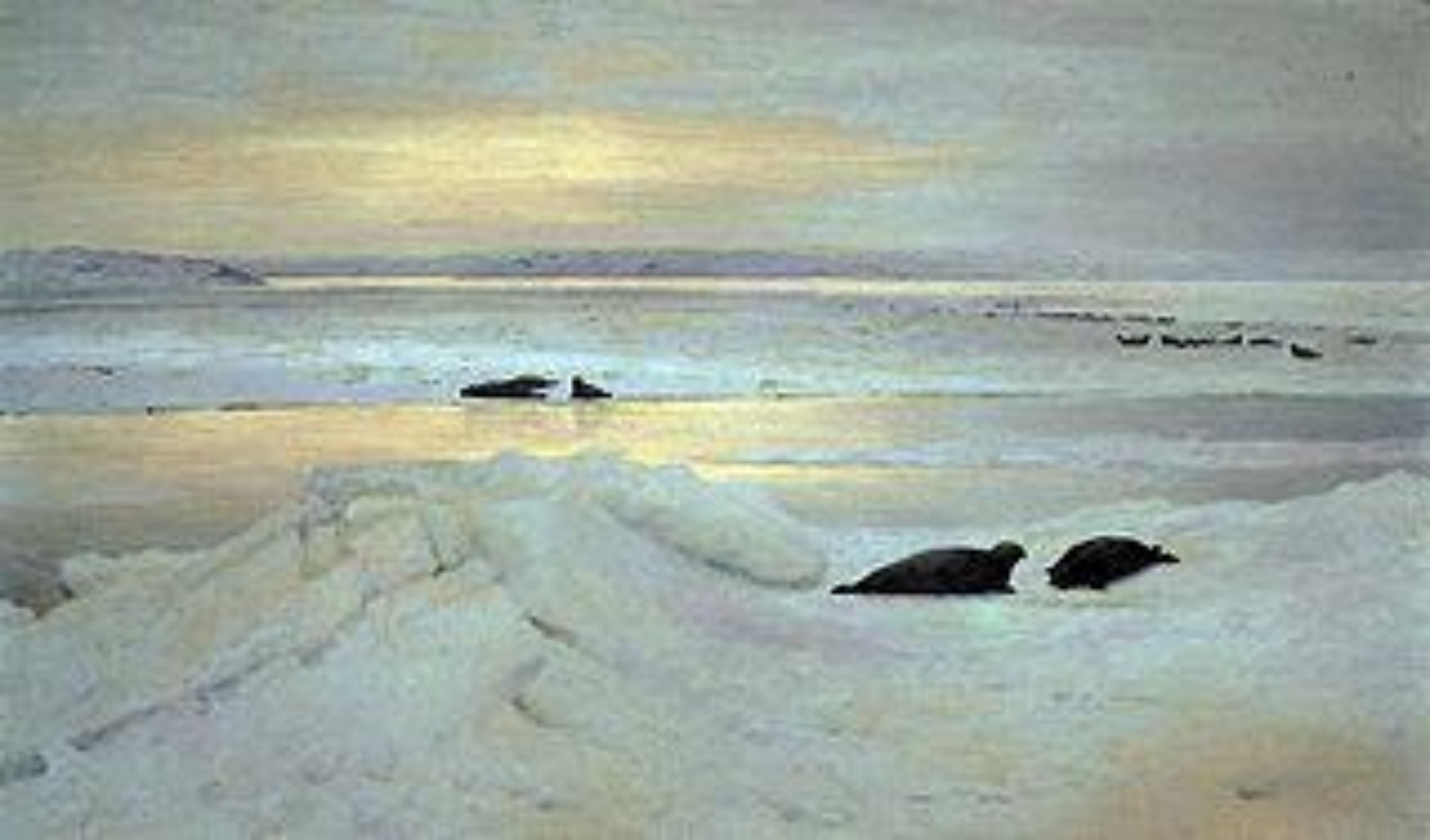
Borisov A.A., “Spring polar night”, 1897. The Tretyakov Gallery