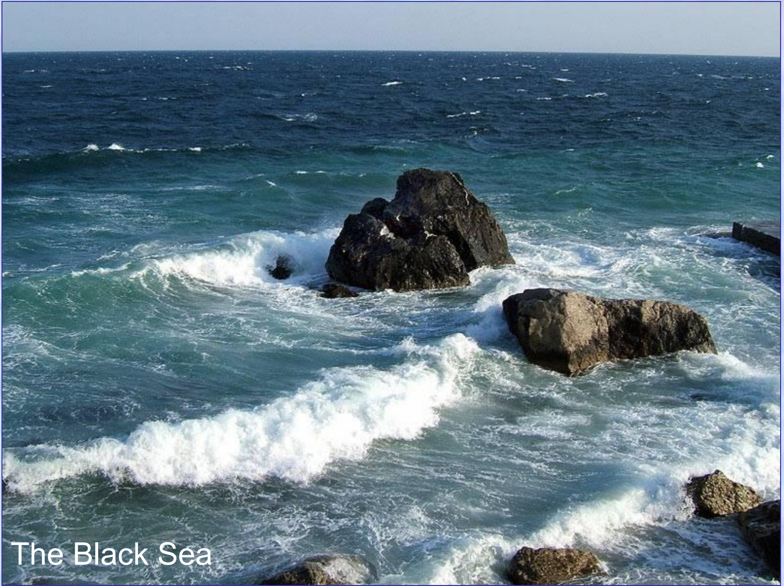
The Black Sea