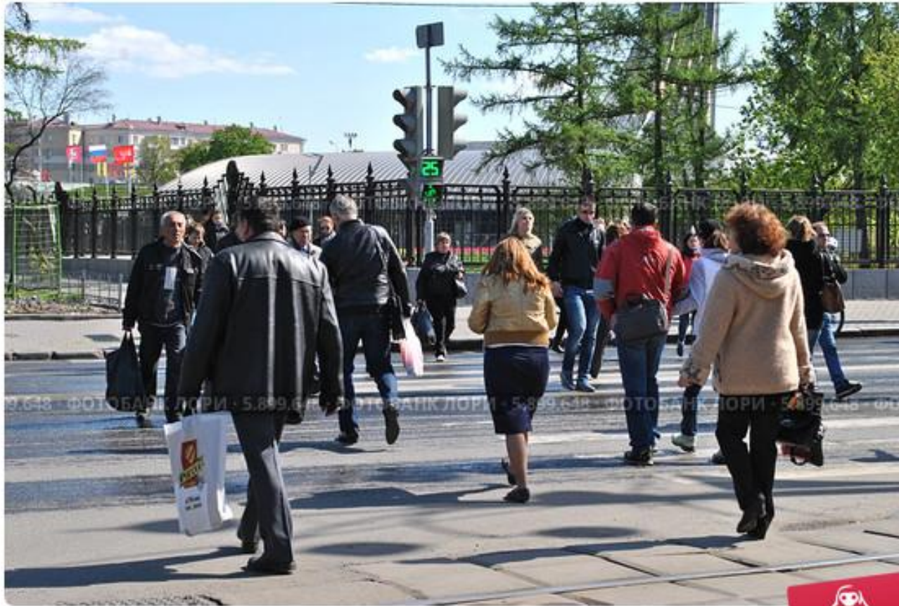
Люди переходят дорогу по пешеходному переходу, Москва