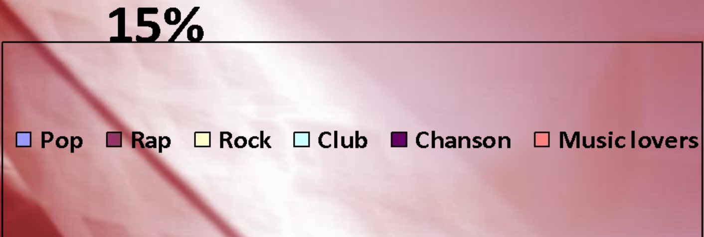
Diagram 3. Musical preferences of young people