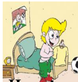
He gets dressed