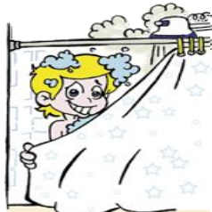
He has a shower