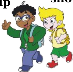
He goes to school