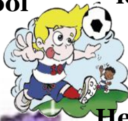
He plays with his friends