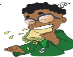
He has lunch