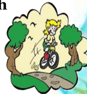
He goes back home