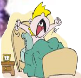
He wakes up