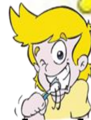
He brushes his teeth