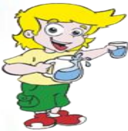
He has breakfast